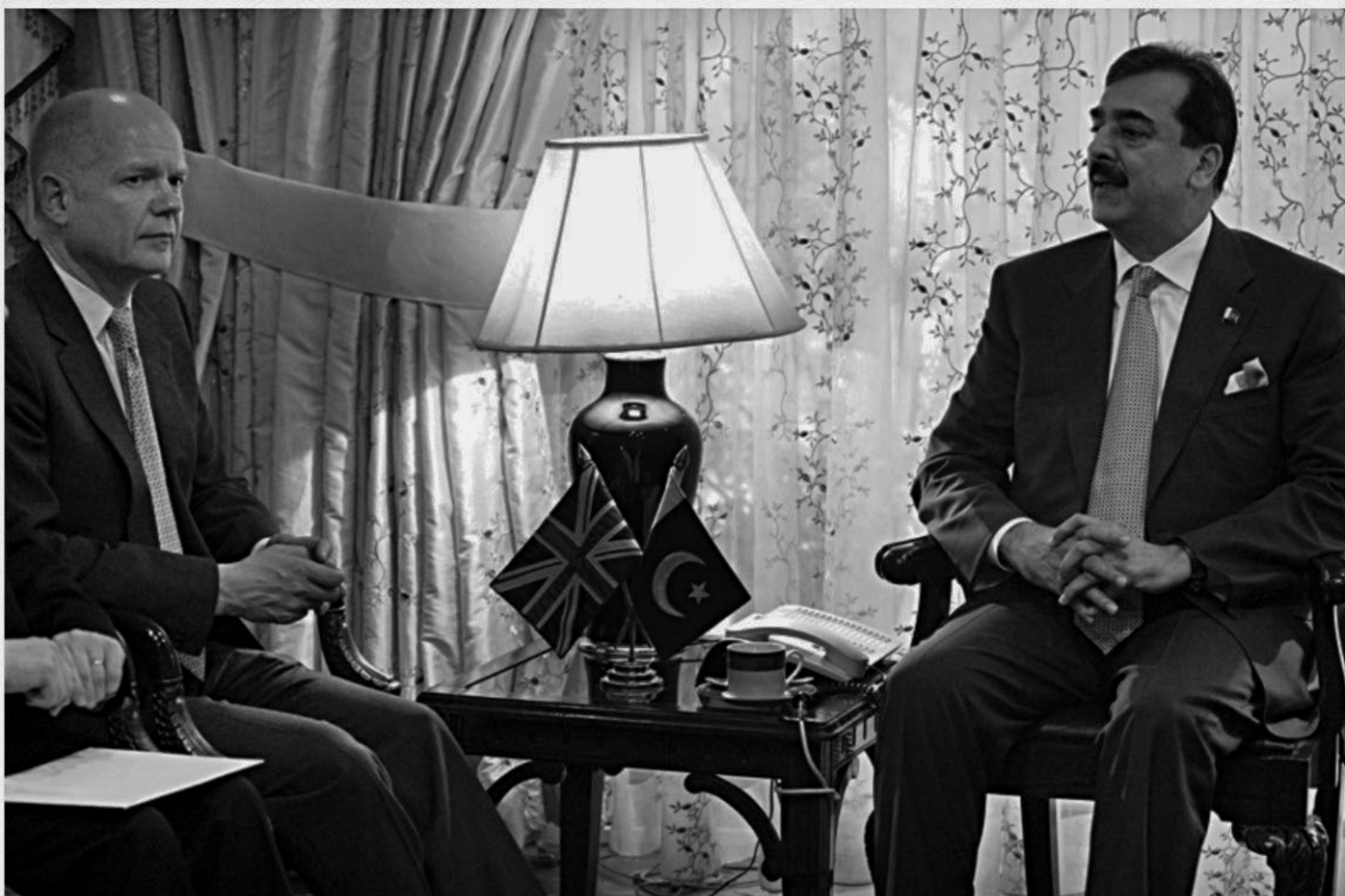
Pakistan Prime Minister Yusuf Raza Gilani (R) meets with British Foreign Secretary William Hague (2nd L) at his office in Islamabad yesterday.