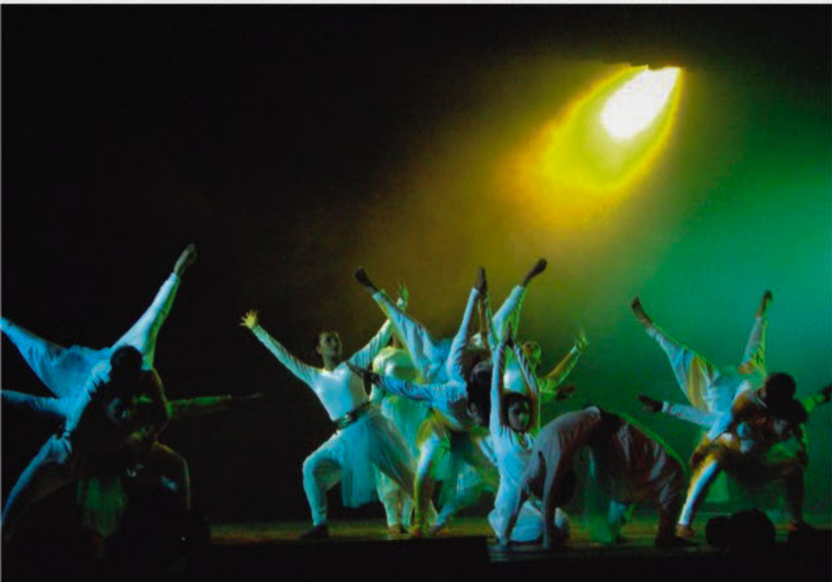
Nrityanchal members, who attended the workshop, dance at the programme.

The World Music Day has been celebrated across the world on June 21 since 1982.