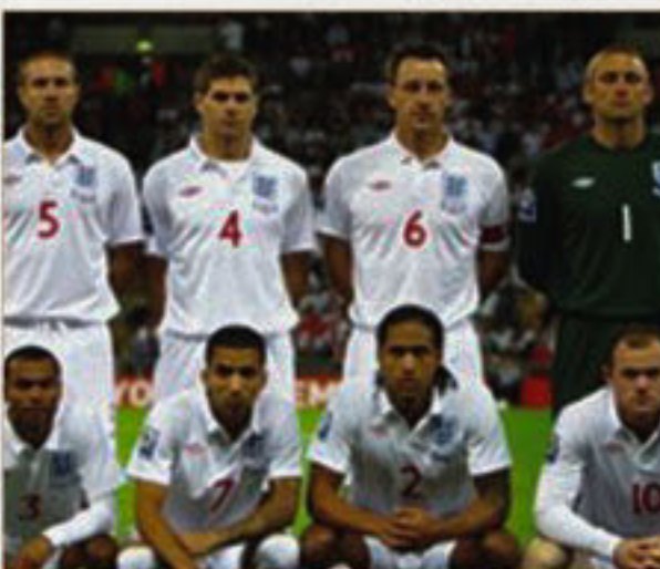
2010 FIFA World Cup South Africa On ESPN at 7:50pm Match: Slovenia vs. England (live)

7:30pm, 10:30pm, 1:00am ETV News (Bangla): 9:00am, 11:00 am, 1:00pm, 3:00pm, 5:00pm, 7:00pm, 9:00pm, 11:00pm abc radio News: 08:00 am, 12:00 pm, 03:00 pm, 06:00 pm, 09:00 pm, 12:00 am; English Bulletin:1:30pm, 7:30pm