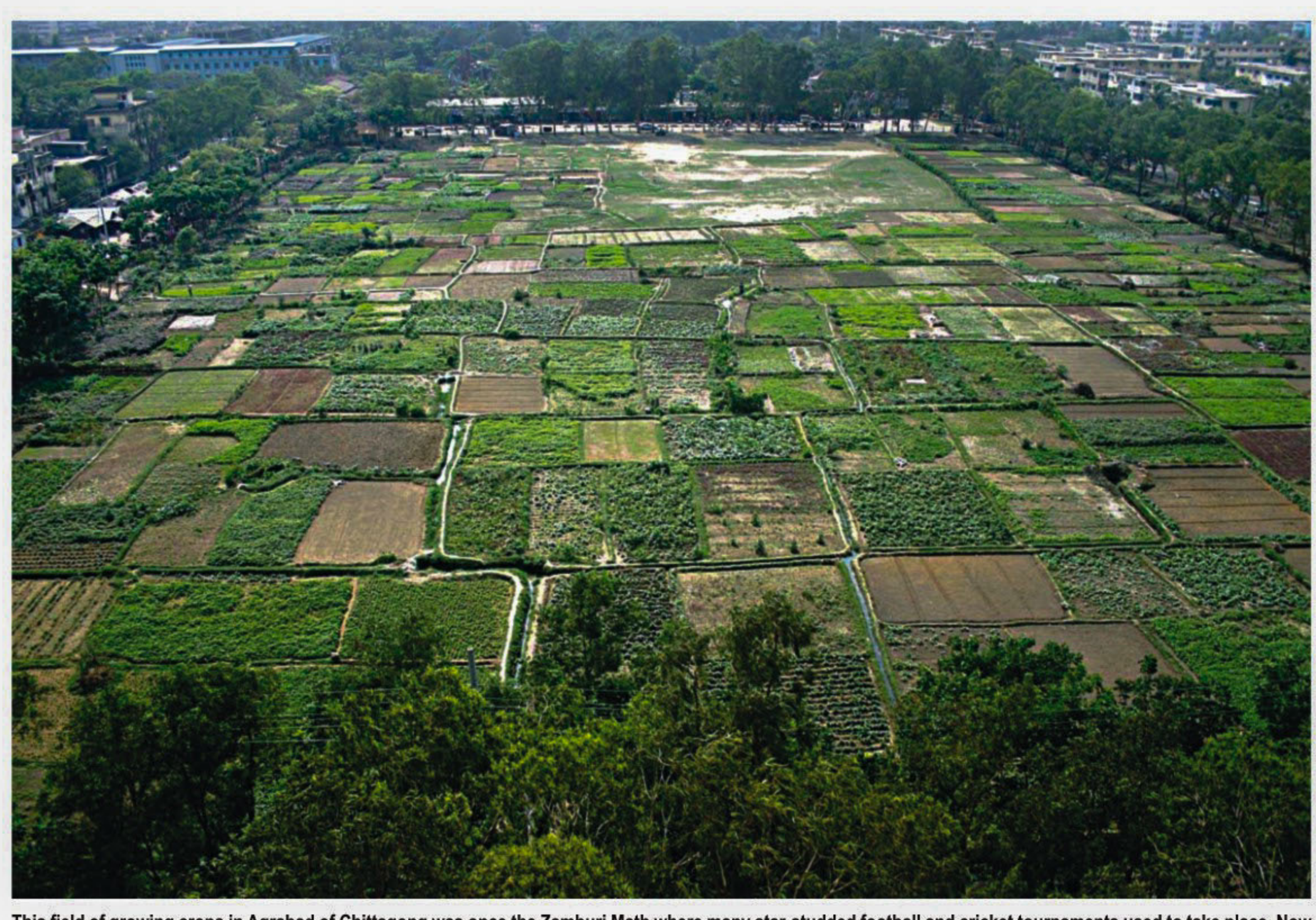
This field of growing crops in Agrabad of Chittagong was once the Zamburi Math where many star-studded football and cricket tournaments used to take place. Now some influential people have started farming on it depriving sports enthusiasts a proper playground.