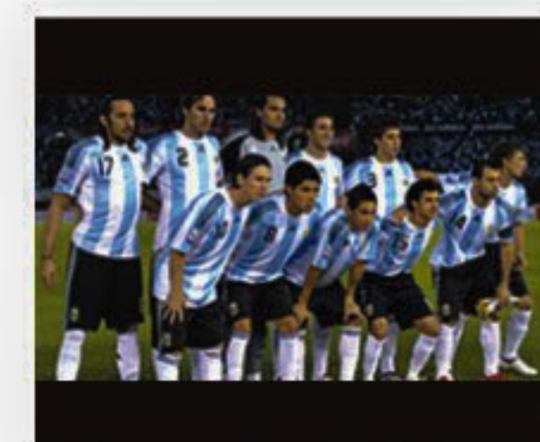
2010 FIFA World Cup South Africa On ESPN at 12:20 am Match: Greece vs. Argentina

7:30pm, 10:30pm, 1:00am ETV News (Bangla): 9:00am, 11:00 am, 1:00pm, 3:00pm, 5:00pm, 7:00pm, 9:00pm, 11:00pm abc radio News: 08:00 am, 12:00 pm, 03:00 pm, 06:00 pm, 09:00 pm, 12:00 am; English Bulletin: 1:30pm, 7:30pm