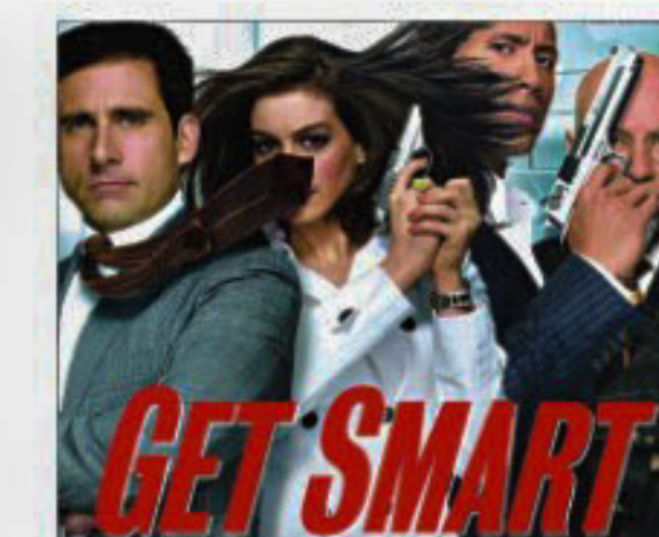
Get Smart On HBO at 9:30pm Genre: Action/ Comedy Cast: Steve Carell, Anne Hathaway