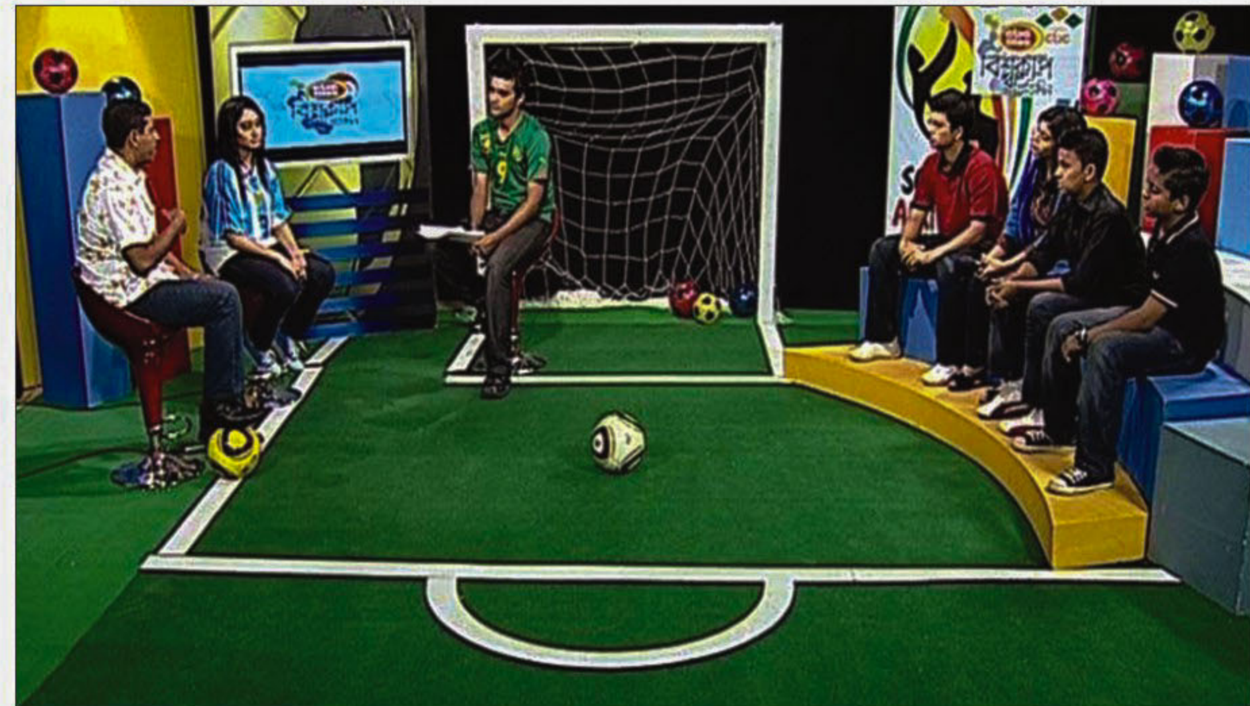
The show includes discussion on the ongoing games -- analysis, prediction, profiles of the participating teams and more.

tion, profiles of the participating teams, profiles of footballers, some information on the venue and more, keeping the audience up to date with the World Cup. The programme also includes a quiz, which offers prizes for the audience.