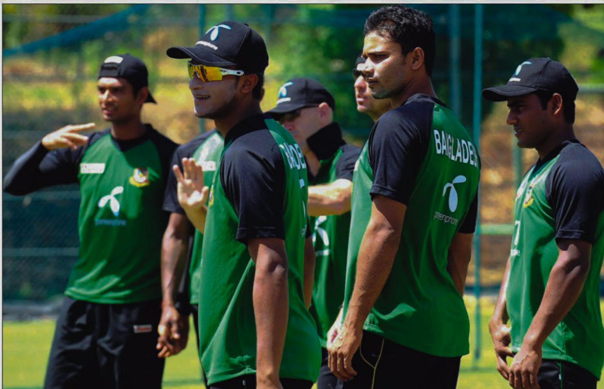
Bangladesh captain Shakib Al Hasan (2nd from L) and teammates wait ahead of a practice session at the Rangiri Dambulla International Cricket Stadium yesterday, on the eve of their inconsequential Asia Cup match against Pakistan today.