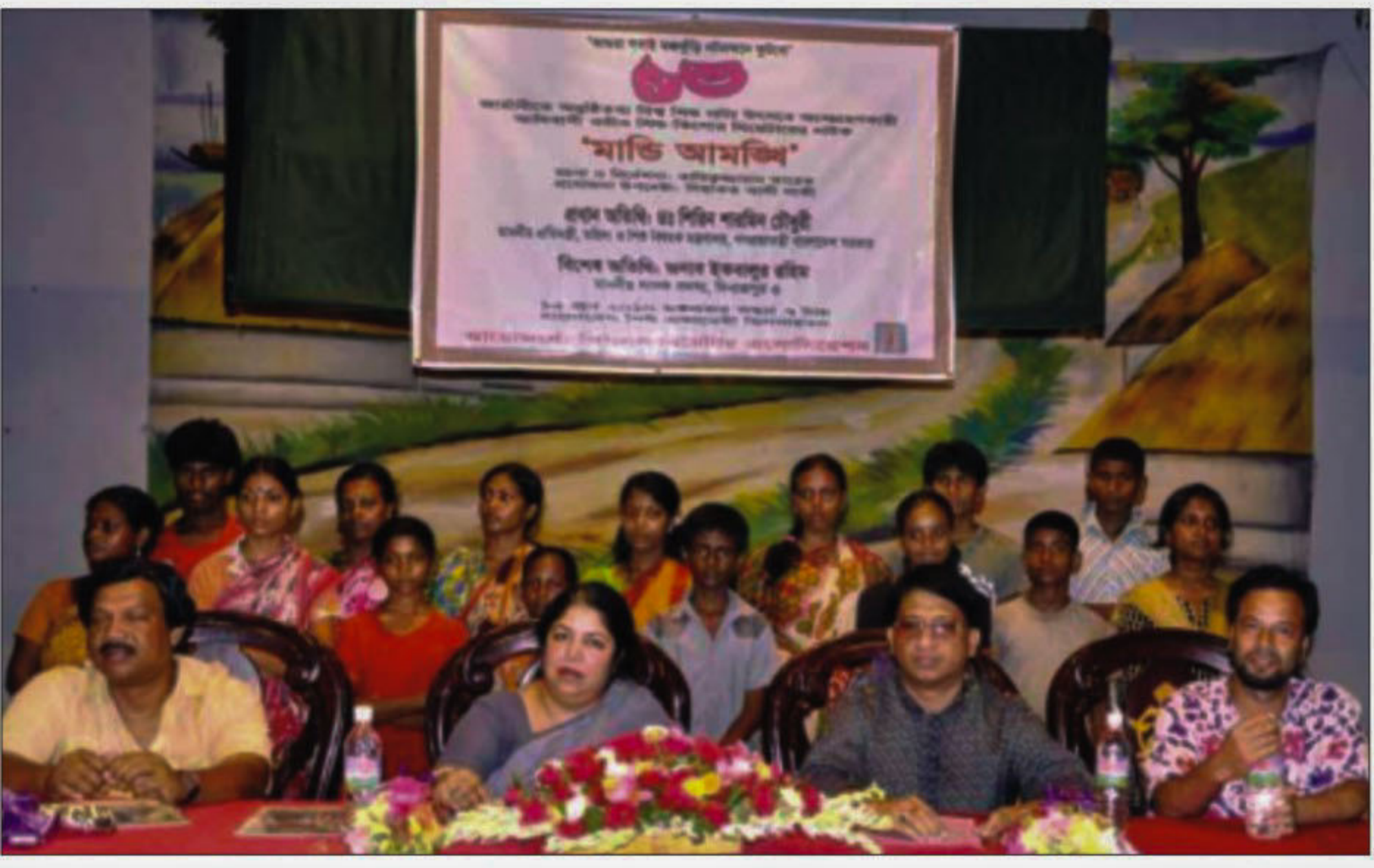
Members of Orao Shishu Kishor Theatre (back rows) with State Minister for Women and Children's Affairs, Dr. Shirin Sharmin Chowdhury (1st row, 2nd from left).