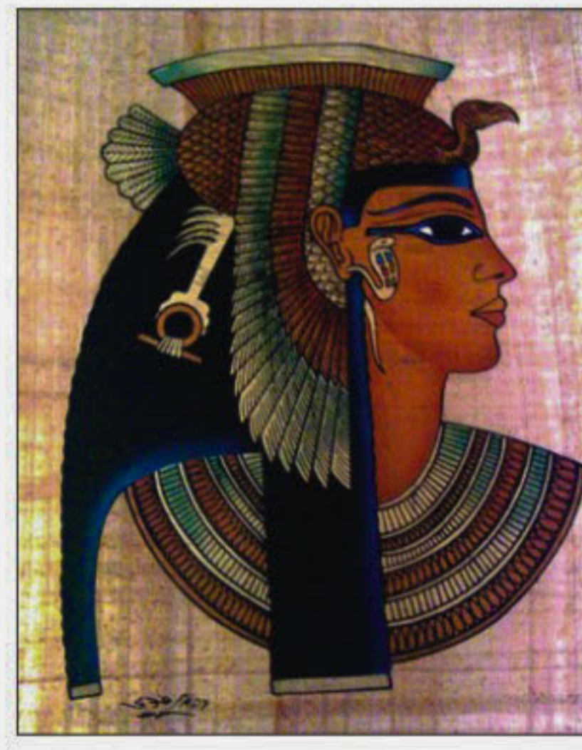
A portrait on Cleopatra on papyrus. Many feel that the role of the legendary queen should have gone to a black actress.

Angelina Jolie is at the centre of a race row with objections being raised to her playing Cleopatra on screen, a role many say should have gone to a black actress. The 35-year-old actress is tipped to play the legendary Queen of Egypt and the film's producer, Scott Rudin had said that the role is being developed with her in mind as she has "the perfect look." But the casting has angered members of the African American community, reported Daily Mail online. An Essence Magazine story titled "Another White Actress to Play Cleopatra?" raised the topic, saying, "Honestly, I don't care how full Angelina Jolie's lips are, how many African children she adopts, or how bronzed her skin will become for the film, I firmly believe this role should have gone to a black woman." "Why does Hollywood think it's even slightly plausible to cast white women in roles that would be more sensible to cast