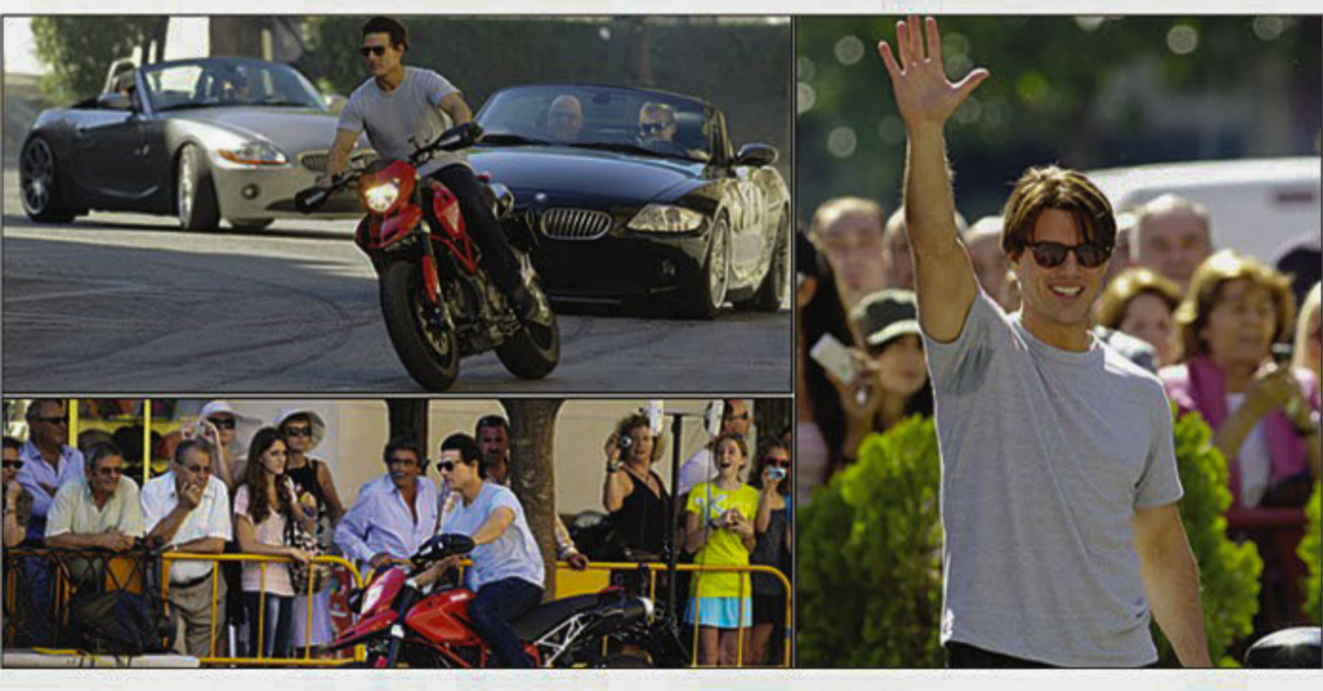
Tom Cruise delights fans in Seville, Spain as he rides a motorbike to recreate scenes from his forthcoming film "Knight and Day" ahead of the international premiere of the movie. The film will be released on June 23 in USA.