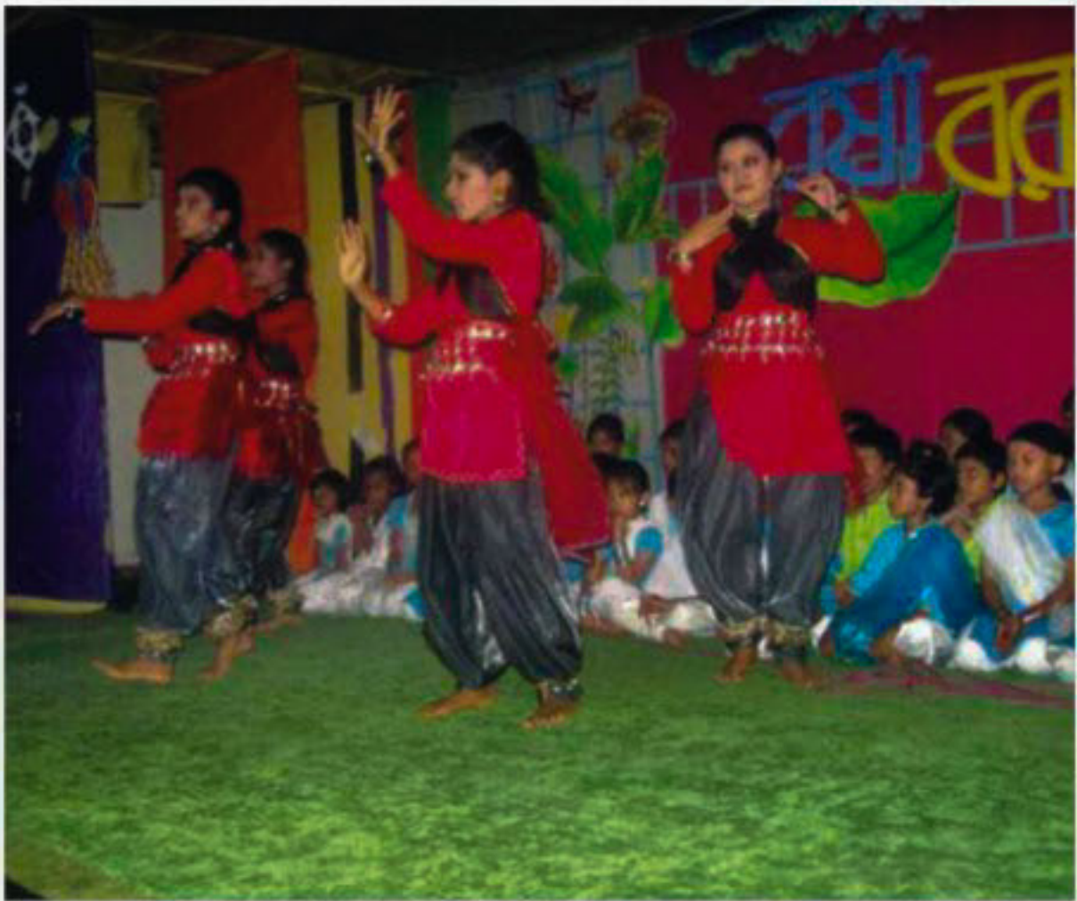
Young artistes of Surcharcha perform at the programme.

The programme started with around a hundred children rendering a song that depicted the changes in nature during monsoon -- new blossoms, foliage, and the overall lush green in the surrounding.