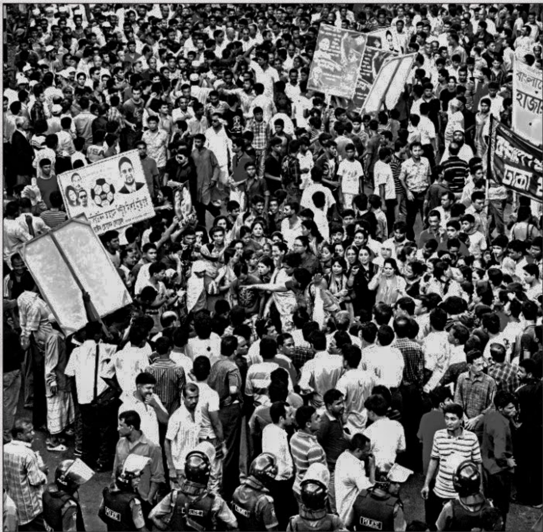
Opposition BNP stages a demonstration in the city yesterday protesting repression on journalists and in support of June 27 hartal. (Story on Page 1)