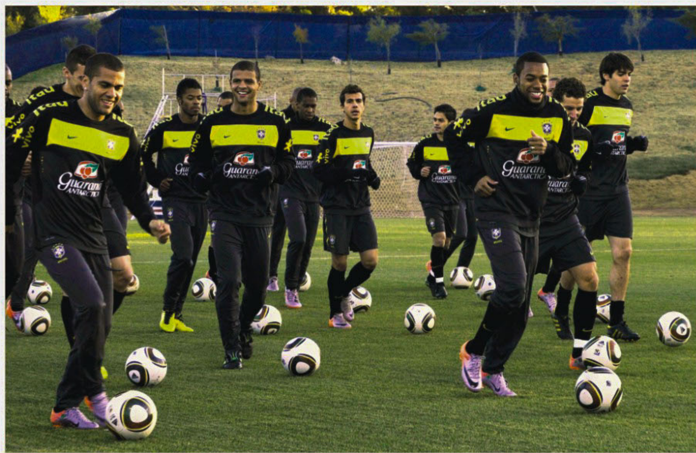
TAMING THE JABULANI: Brazil players move with the ball during a training session on Friday at the St Sthithians School in Johannesburg. Brazil take on Ivory Coast at 12.30am tonight.

Dunga's team are not expecting the rigid marking