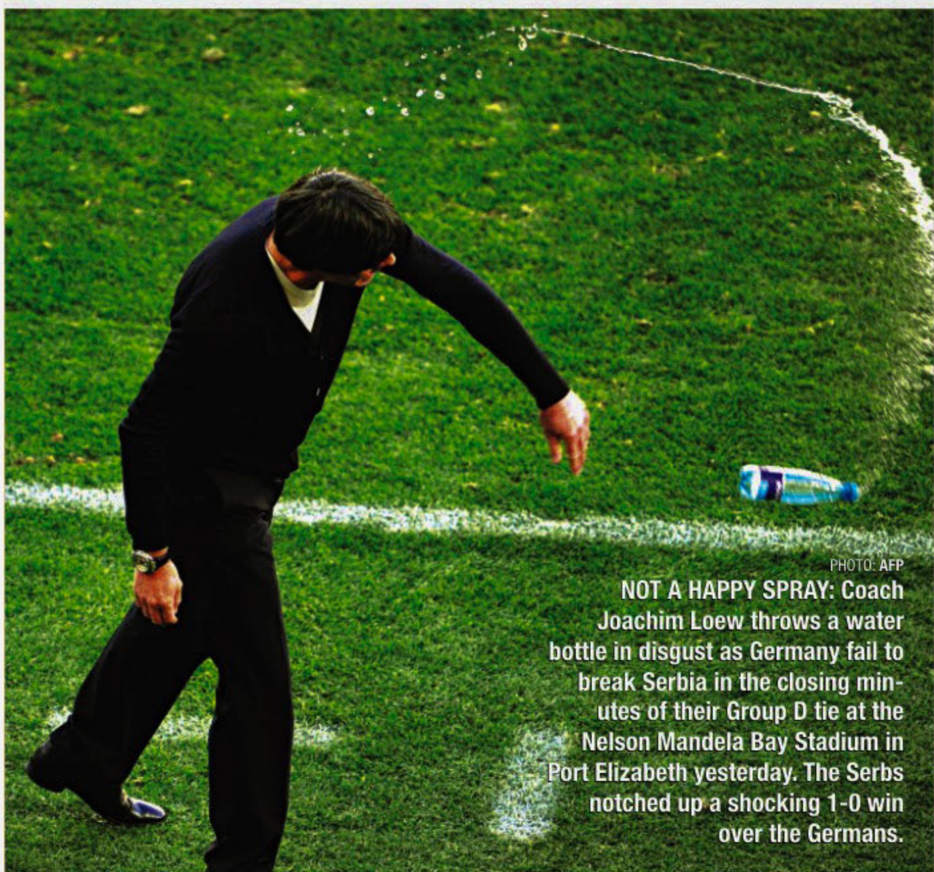
NOT A HAPPY SPRAY: Coach Joachim Loew throws a water bottle in disgust as Germany fail to break Serbia in the closing minutes of their Group D tie at the Nelson Mandela Bay Stadium in Port Elizabeth yesterday. The Serbs notched up a shocking 1-0 win over the Germans.