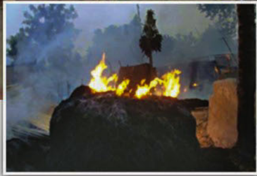
Houses burn as villagers of Talupara in Sirajganj torch the homes of stalkers yesterday after the stalkers attacked protesters.