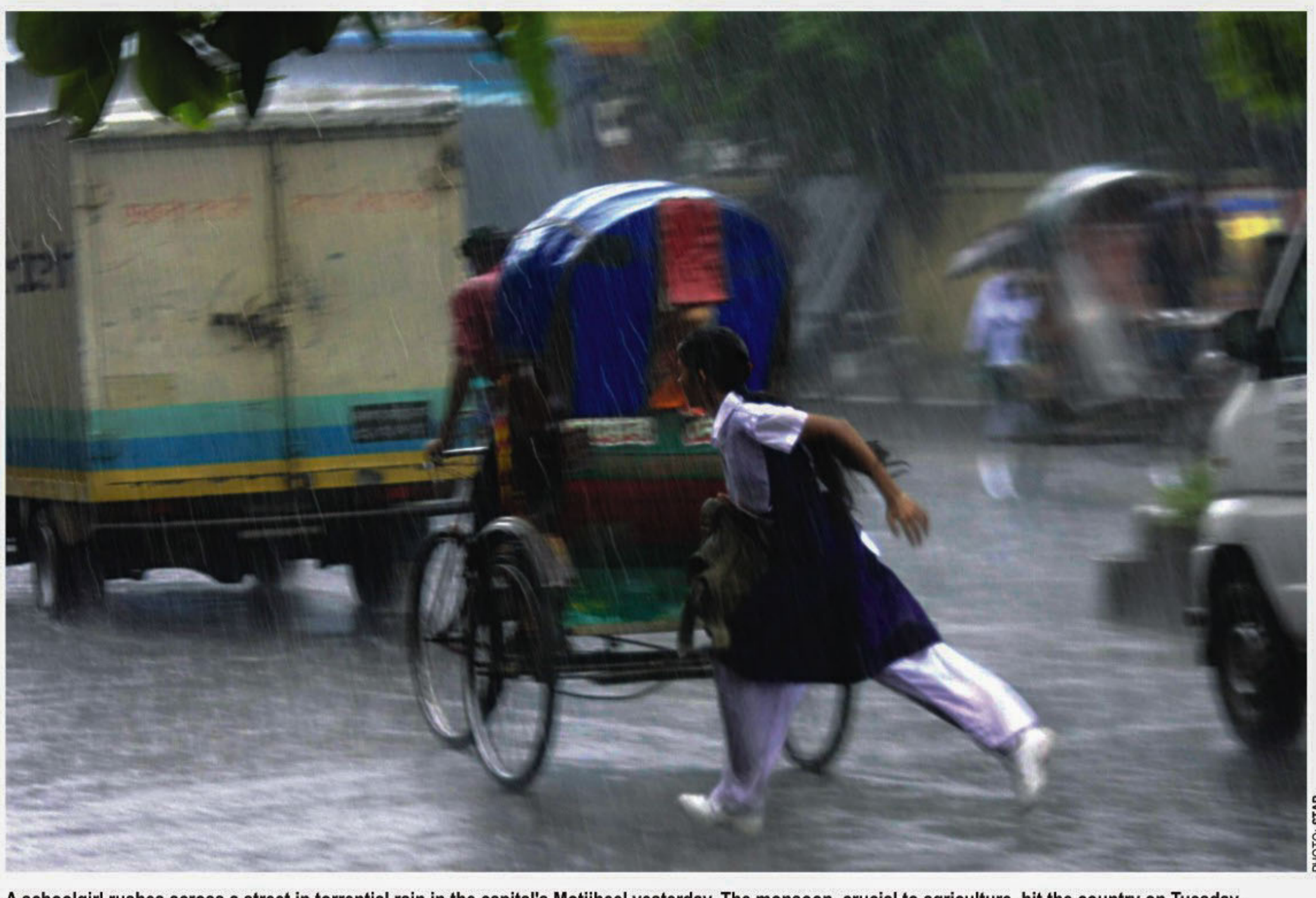
A schoolgirl rushes across a street in torrential rain in the capital's Motijheel yesterday. The monsoon, crucial to agriculture, hit the country on Tuesday.