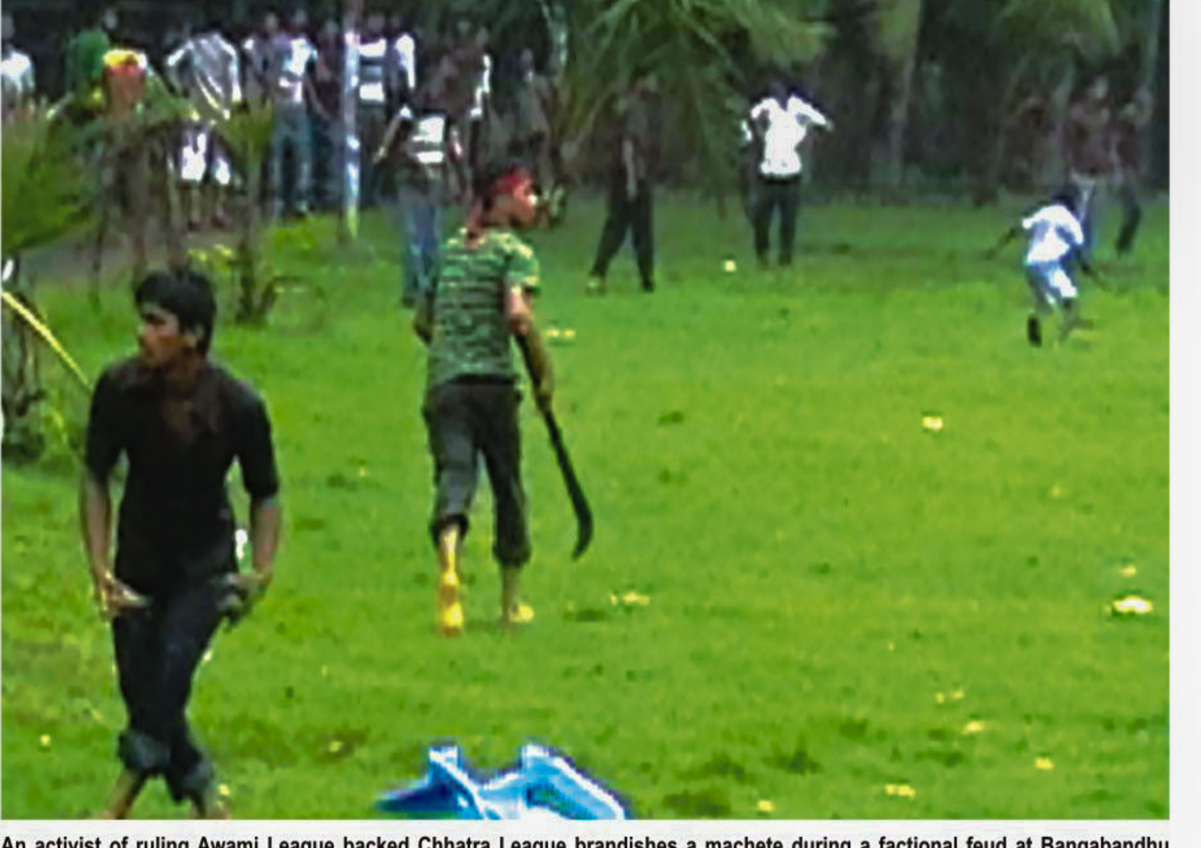
An activist of ruling Awami League backed Chhatra League brandishes a machete during a factional feud at Bangabandhu University College in Gopalganj yesterday.