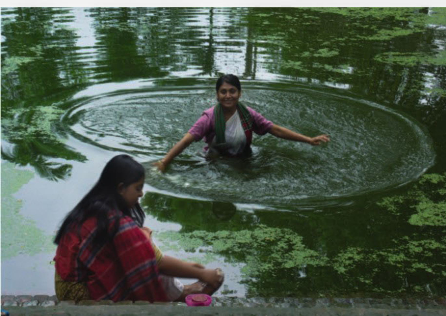
A scene from "Rabeya."