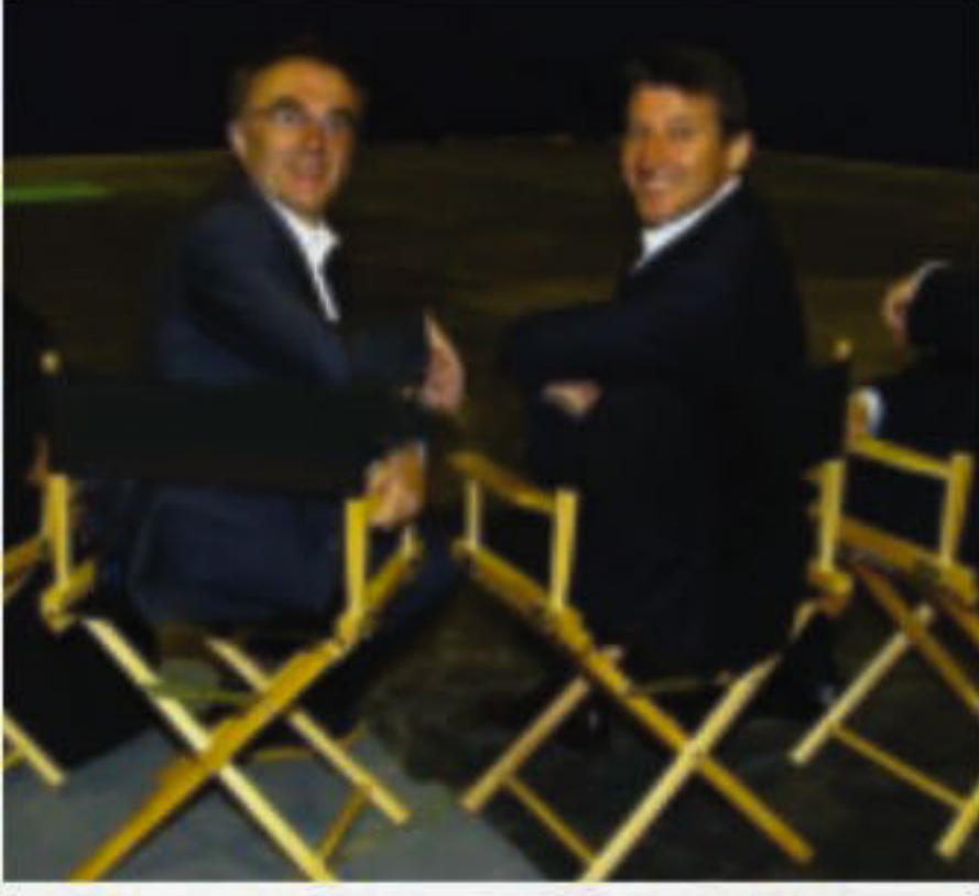
Danny Boyle (L) at the 3 Mills Studios.

Zhang Yimou, China's most famous filmmaker, directed the opening ceremony for the Beijing Games in 2006.