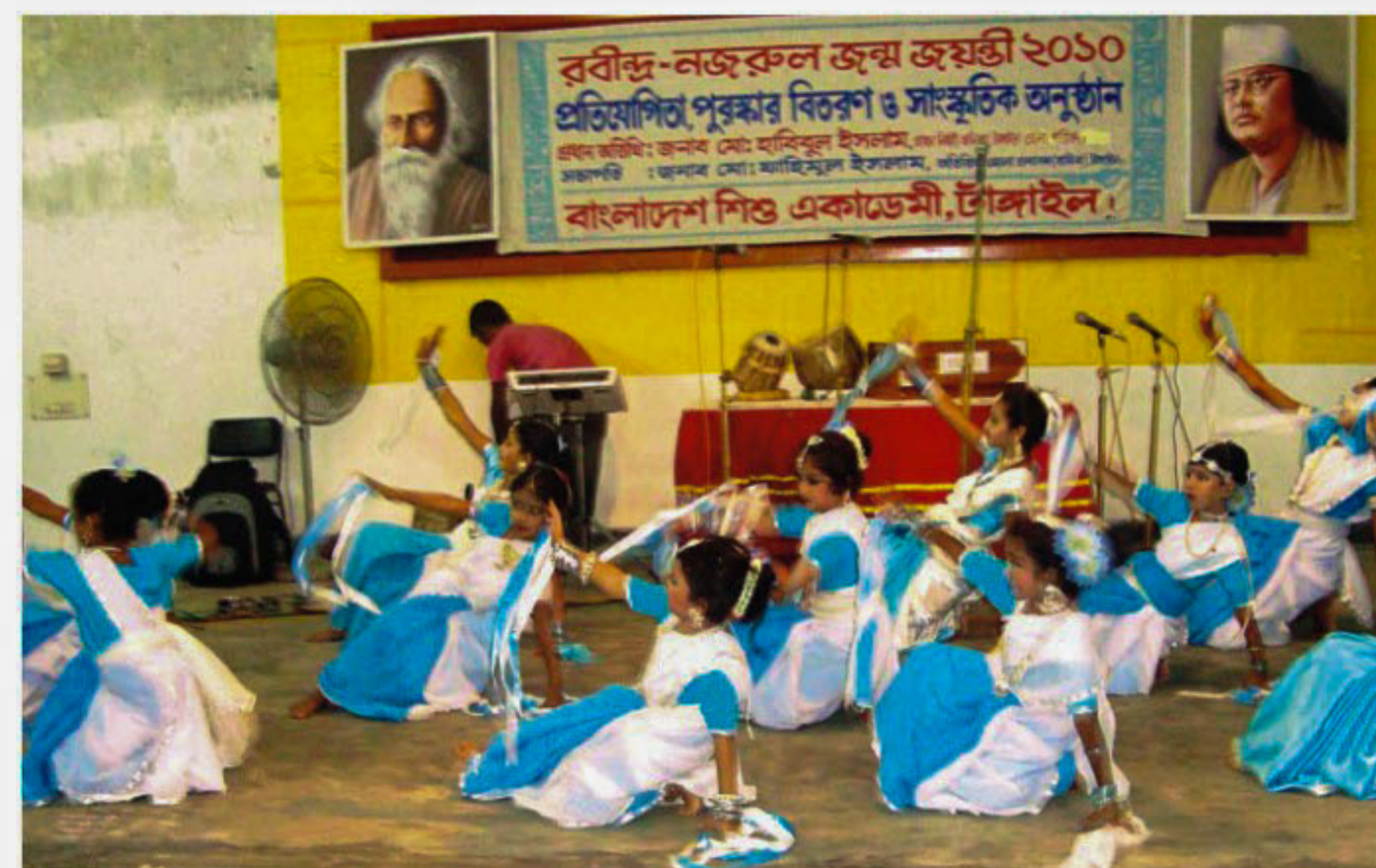
Artistes perform at the songs and poetry recital.