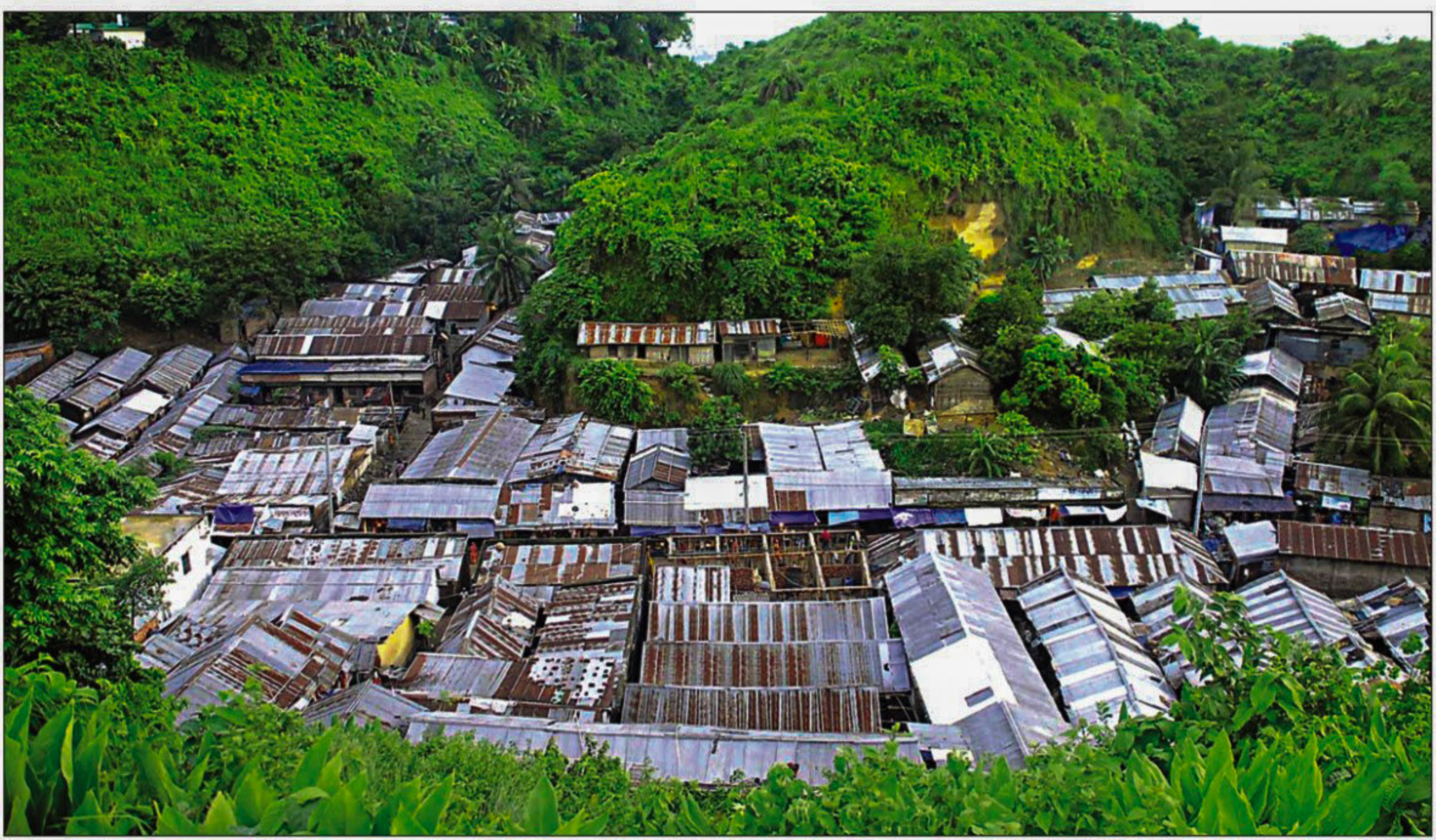
Neighbourhoods are still built cutting down slopes of hills and in the valleys ignoring the dangers of landslides. The photo was taken at Matijharna near Lalkhanbazar in Chittagong.