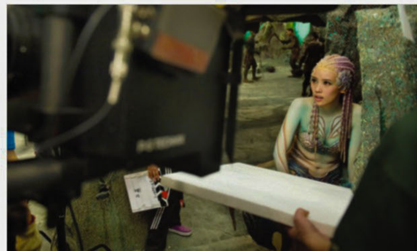
Chinese actress Shi Yanfei filming "Empires of the Deep" on a large set in Huairou, China.

The producers say the budget for "Empires" is $100 million, less than Hollywood juggernauts but the biggest ever for a Chinese movie, surpassing John Woo's dynastic war epic, "Red Cliff." It is an ambitious departure from the formulaic historical or Communist propaganda movies usually churned out by the Chi-