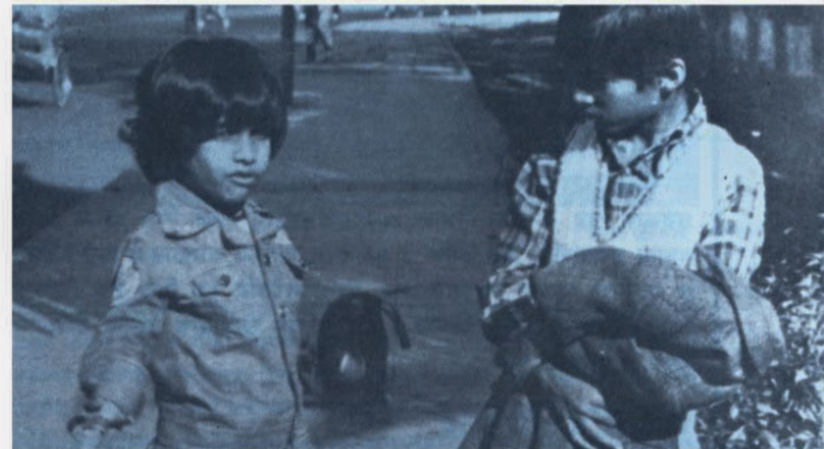
A scene from "Emiler Goenda Bahini."

He said, "Many know 'Emiler Goenda Bahini' as the first film made in Bangladesh for children. But what many don't know is that through the film he started a modern film language that is unique. His later works convey that style."