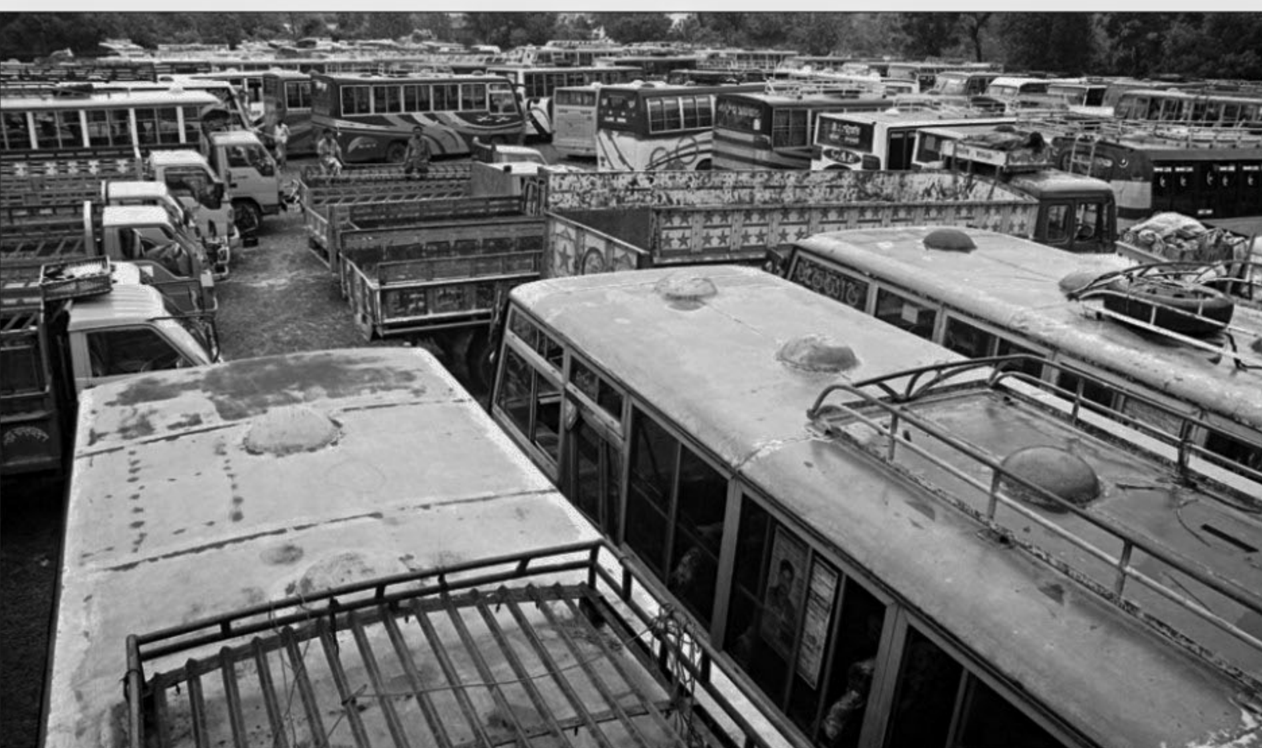
Police requisition many buses for today's Chittagong City Corporation election duty. The picture was taken from Dampara police lines ground in the port city of Chittagong yesterday.