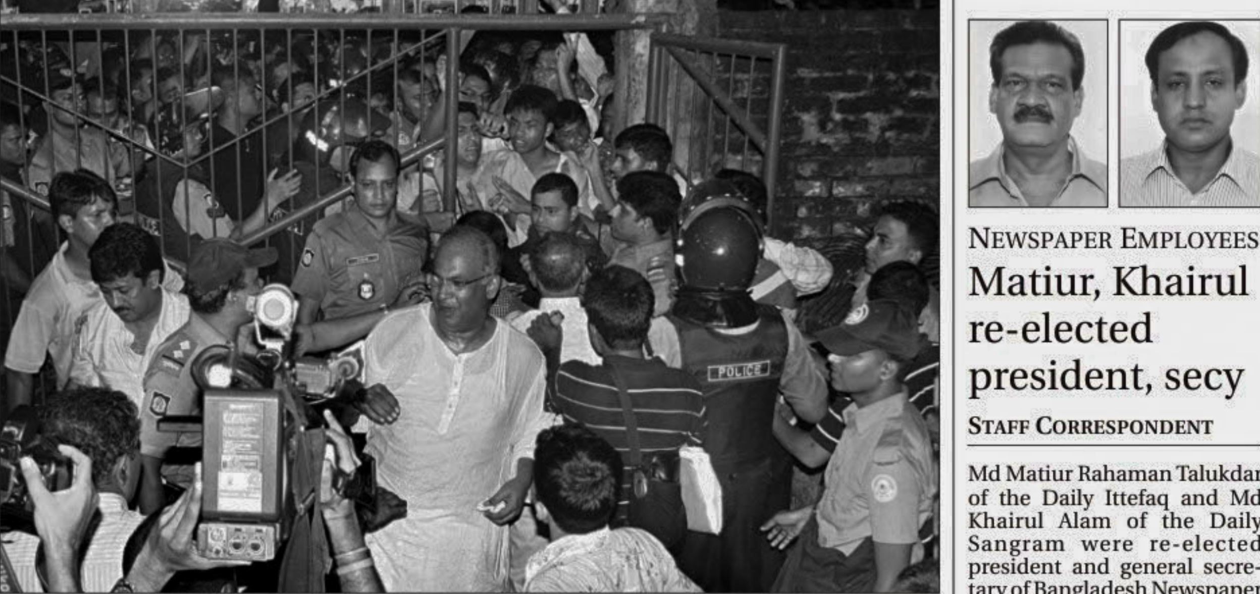
Police bring BNP leader Salauddin Quader Chowdhury to Bakolia Police Station in Chittagong last night. The BNP leader, however, was released several hours after his arrest. (Story on page 1)

UNB, Dhaka President Zillur Rahman will leave Dhaka for London on June 19 for medical check-up at Bupa Cromwell Hospital. During his 10-day visit to the United Kingdom, Zillur will be accorded a reception at Kensington Hall in London by Bangladesh expatriates in the UK as well as in Europe. Family members and secretaries of office to the president's consent will accompany the president. Zillur is expected to return home on June 29.