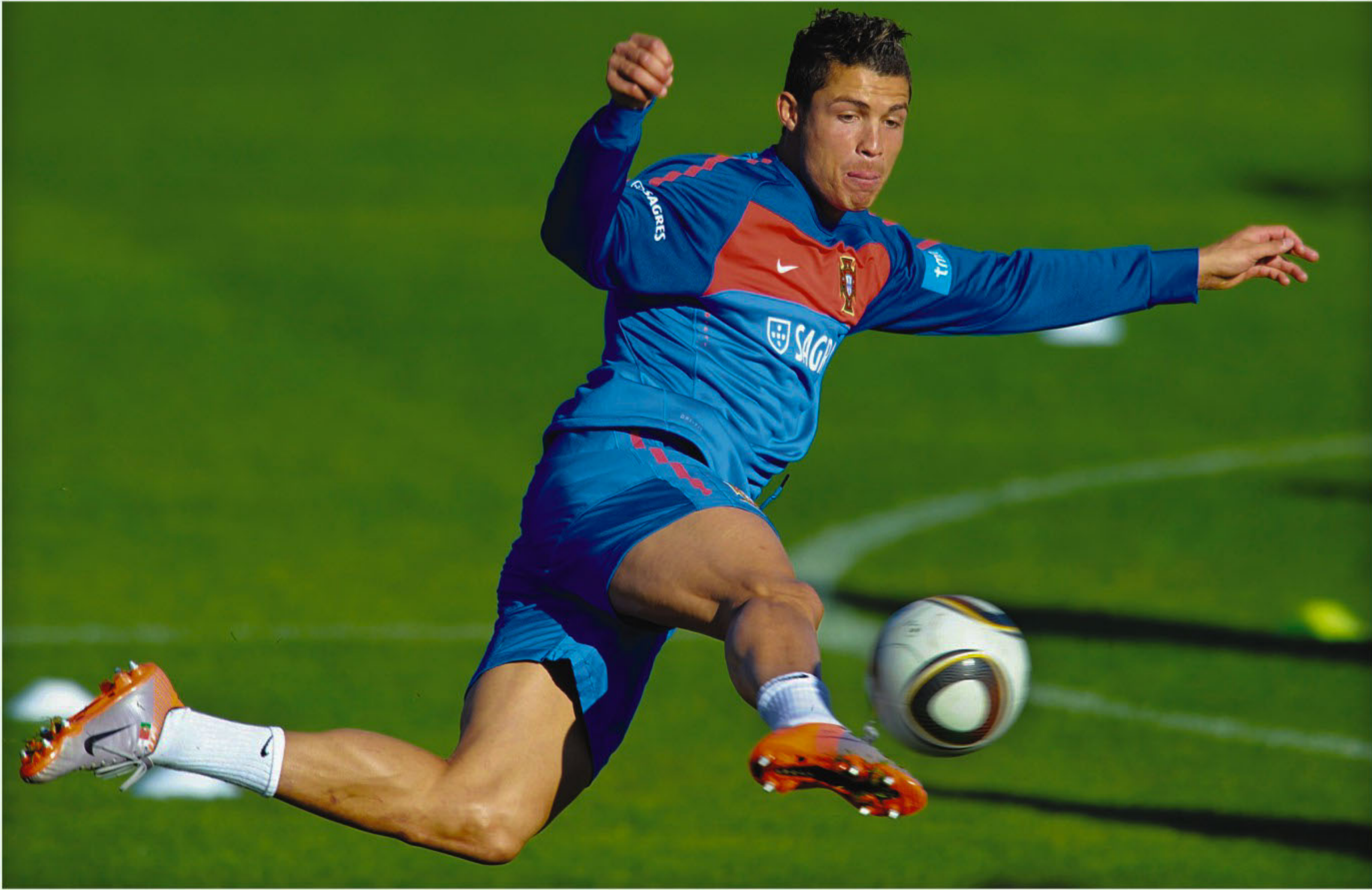
TIME TO DELIVER AT THE BIGGEST STAGE: Portugal striker Cristiano Ronaldo executes a spectacular side volley during a training session at Bekker High School in Magaliesburg on Sunday. Ronaldo will be the man to watch when Portugal launch their World Cup campaign against Ivory Coast in Port Elizabeth today.

Germany were already winning by 2-0 when Cahill left the pitch, but Australia will miss the Everton striker in their next match -- Saturday against Ghana.