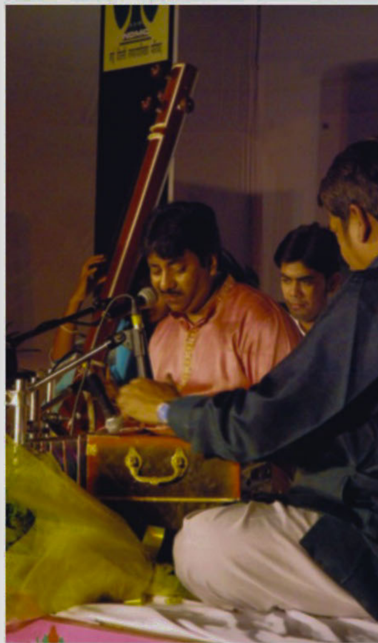
Ustad Rashid Khan (centre) during a performance.

Ustad Rashid Khan's renditions stand out for the emotional overtones in his melodic elaboration. Says the ustad, "The emotional content may be in the alaap , sometimes while singing the bandish , or while giving expression to the meaning of the lyrics." This brings a touch of