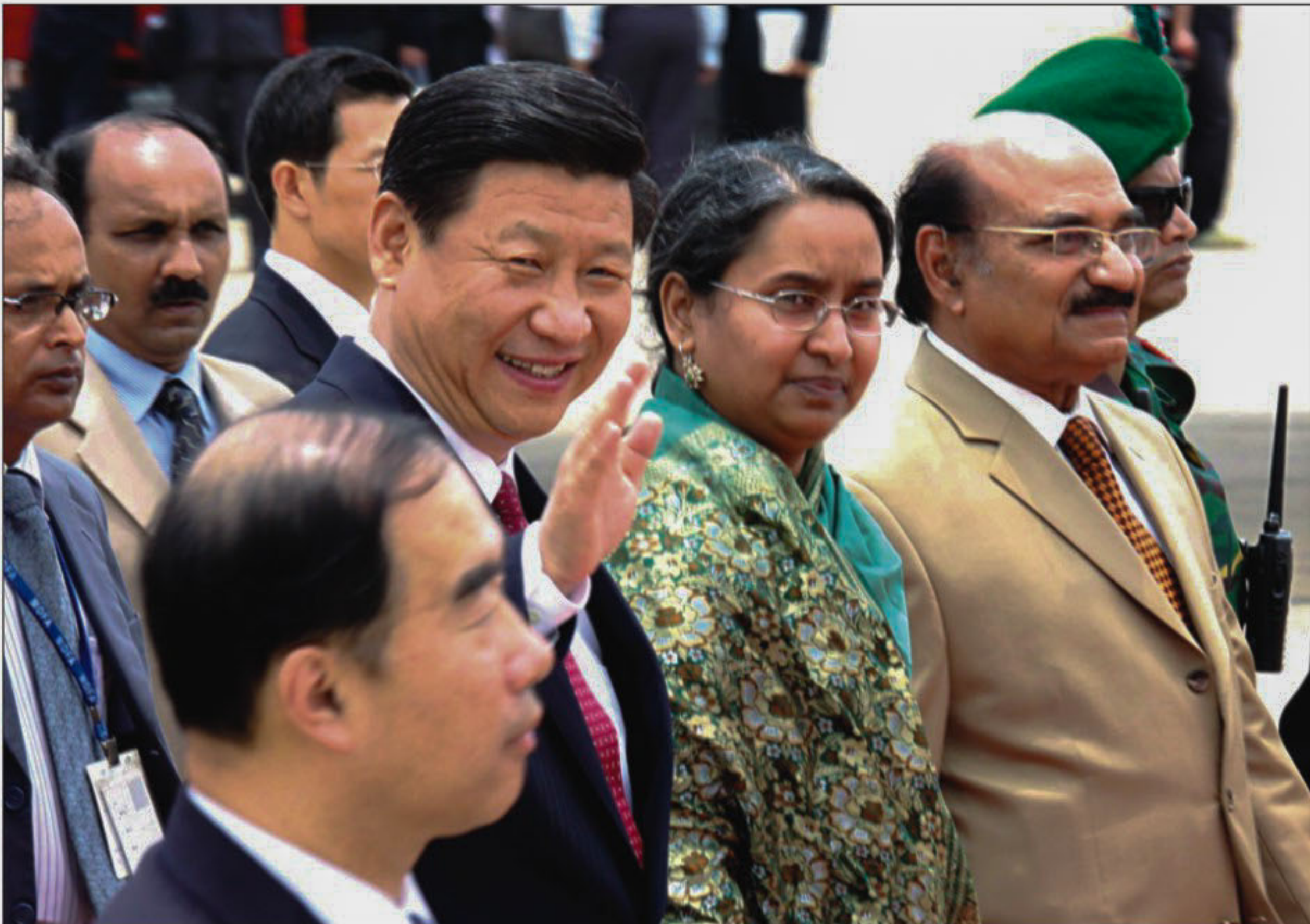
Chinese Vice President Xi Jinping waves after Foreign Minister Dr Dipu Moni receives him at Hazrat Shahjalal International Airport in the city yesterday. (Story on Page 1)

Earlier, he served as the director general the of Press Institute of Bangladesh (PIB), the Principal Information Officer (PIO) and the Director General of the Department of Film and Publication, it added.