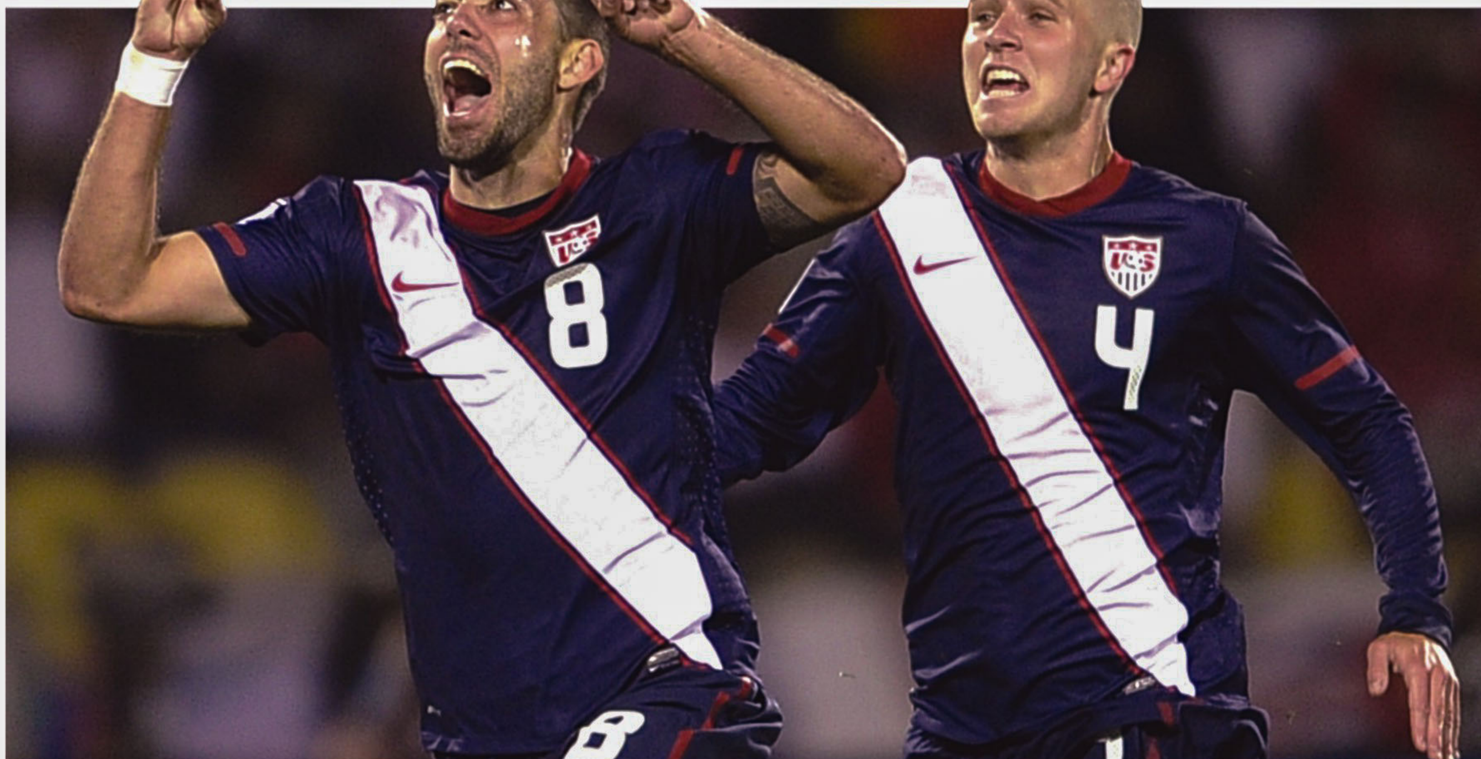
United States midfielder Clint Dempsey (L) is ecstatic after scoring the equalising goal against England during their Group C first round match at the Royal Bafokeng Stadium in Rustenburg last night.

DHAKA SUNDAY JUNE 13, 2010, E-mail: sports@thedailystar.net