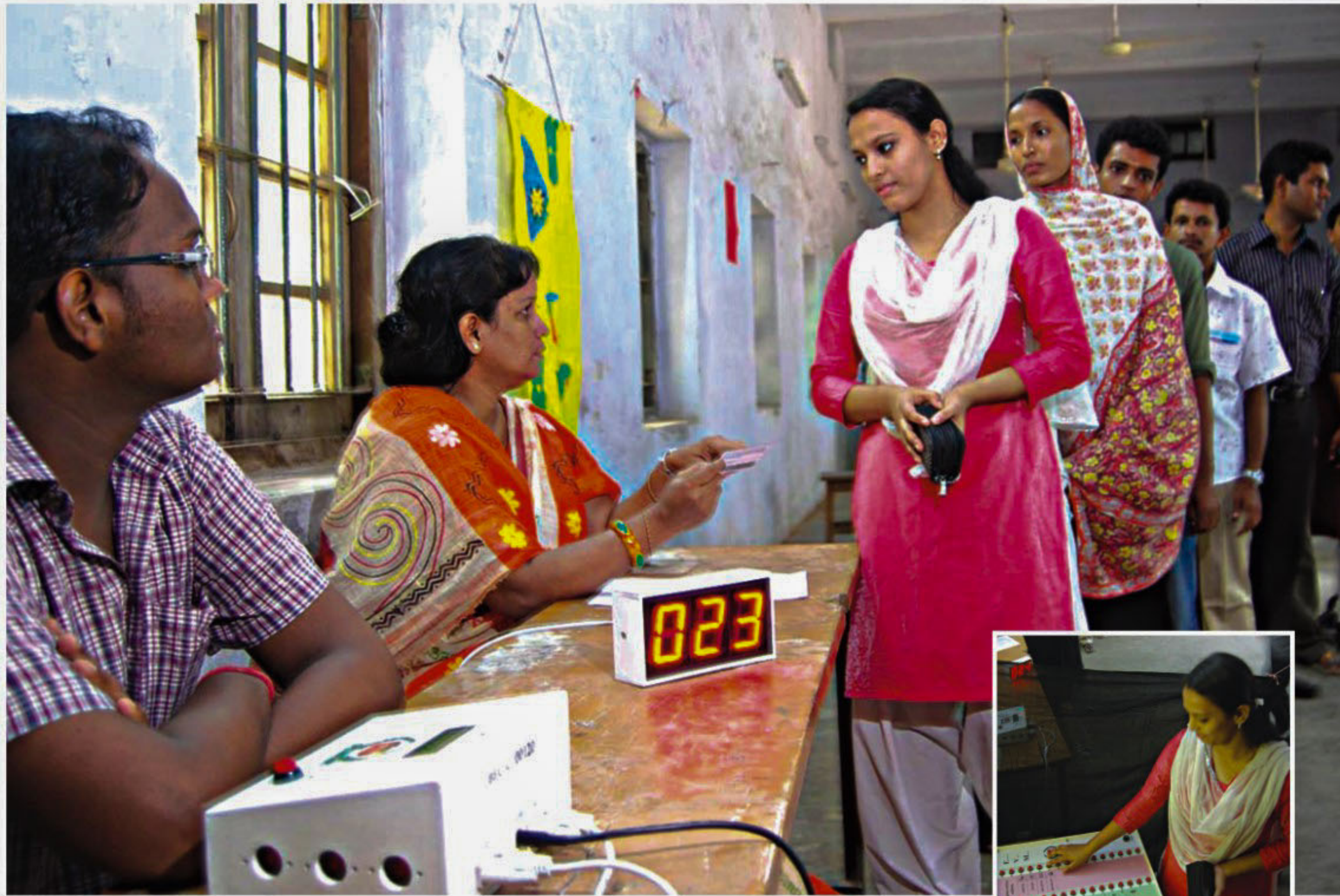
People stand in queue to try out the new electronic voting system at Jamalkhan in Chittagong as the Election Commission starts a two-day trial before introducing the system at the CCC polls.