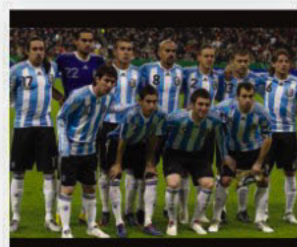
2010 FIFA World Cup South Africa On BTV and ESPN at 7:50 pm Argentina Vs Nigeria (live)

7:30pm, 10:30pm, 1:00am ETV News (Bangla): 9:00am, 11:00 am, 1:00pm, 3:00pm, 5:00pm, 7:00pm, 9:00pm, 11:00pm abc radio News: 08:00 am, 12:00 pm, 03:00 pm, 06:00 pm, 09:00 pm, 12:00 am; English Bulletin: 1:30pm, 7:30pm