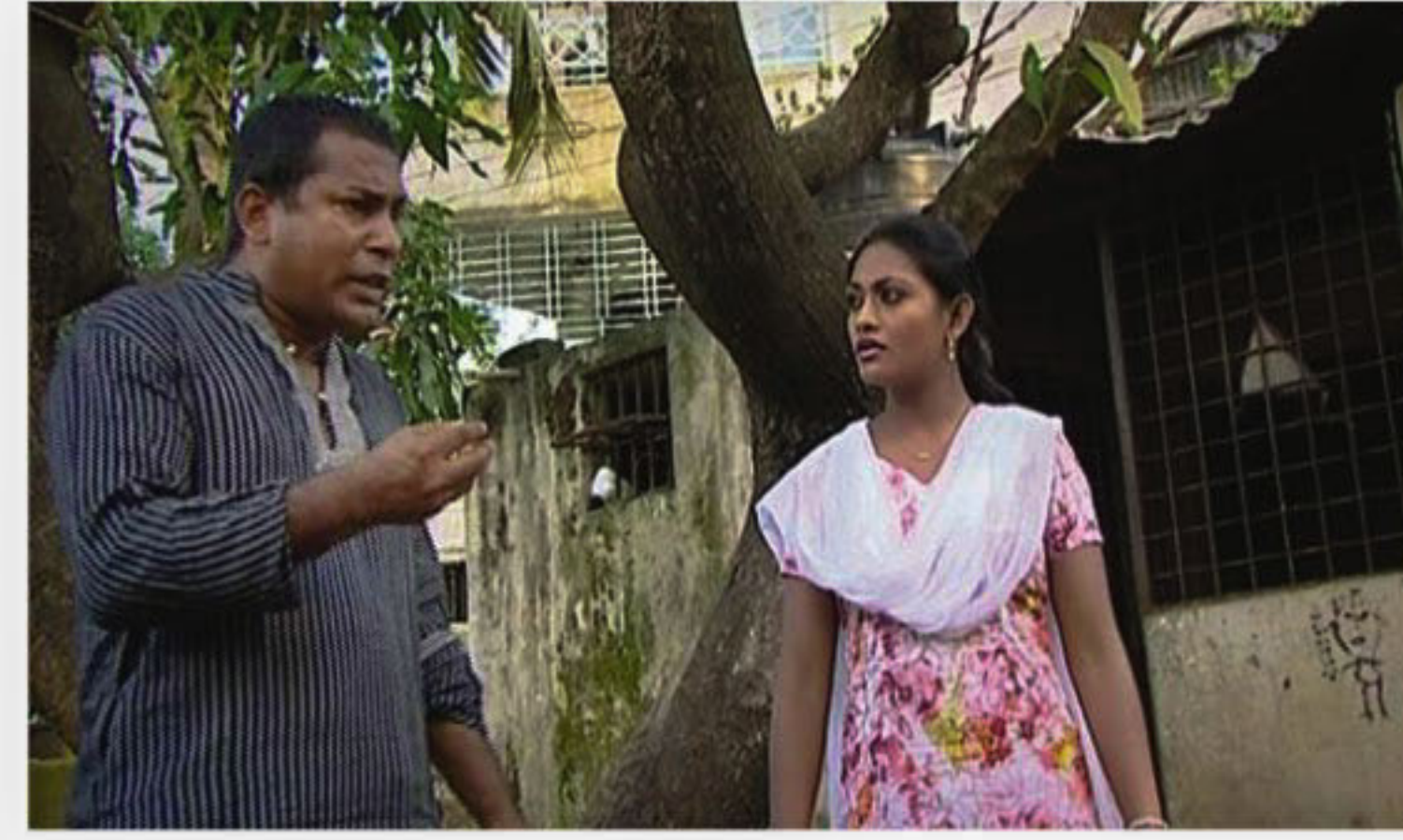
A scene from the serial.