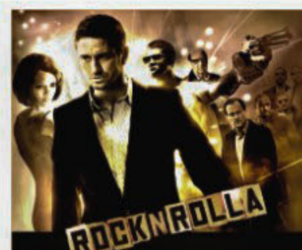
Rocknrolla On HBO at 9:30 pm Genre: Action Cast: Gerard Butler, Thandie Newton