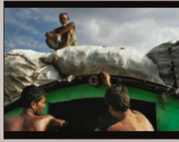
Photo Exhibition Photographer: Norbert Enker Title: Recycled Venue: Goethe-Institut Bangladesh, H-10, R-9, Dhanmondi Date: June 2-23 Time: 10am 8pm

Photography and Installation Show Photographer: Zaid Islam Title: Used Reused Venue: Dhaka Art Centre, R-7 A, H-60, Dhanmondi Date: June 5-16 Time: 3pm-8pm