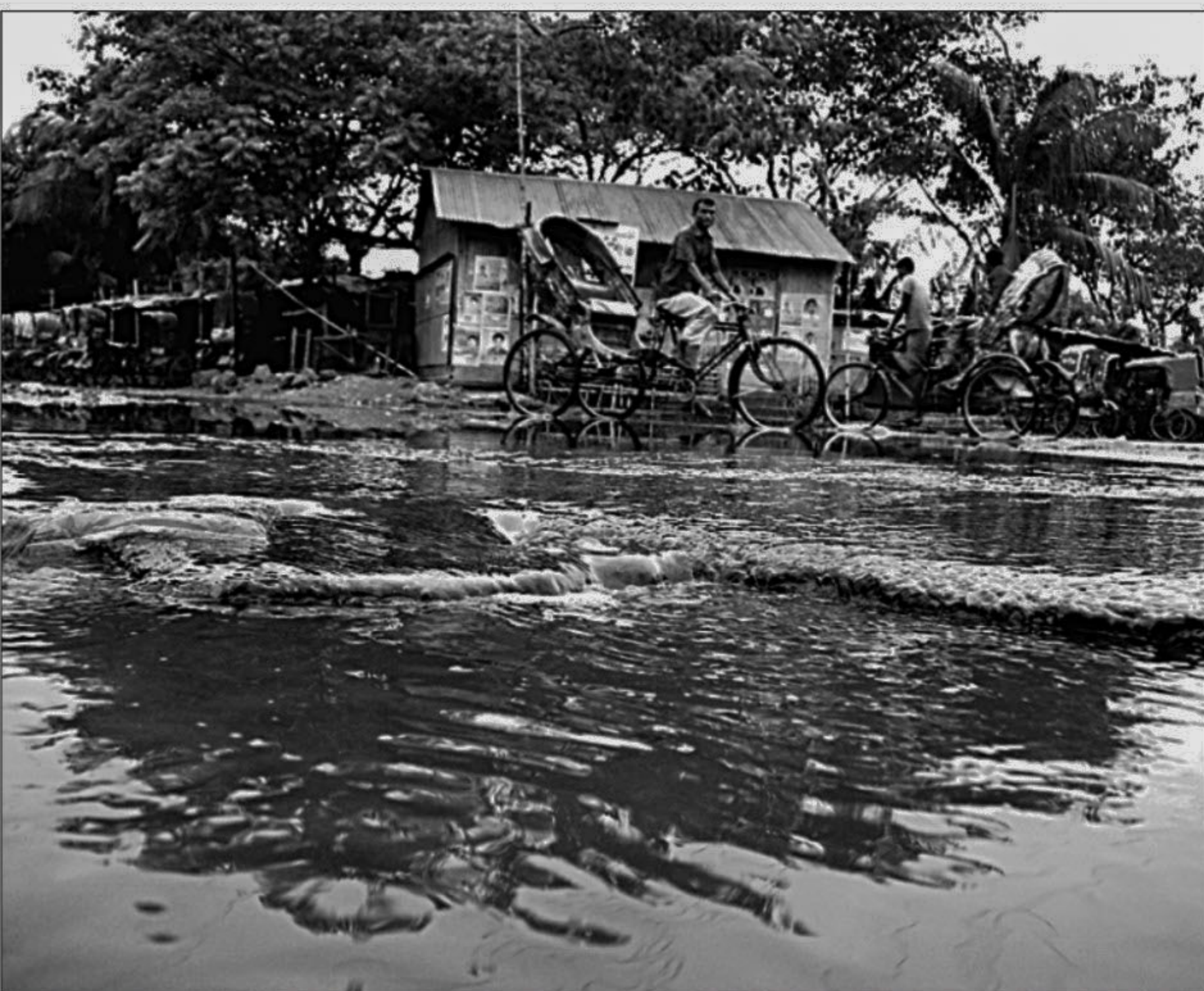
Sewage water flows onto a road at Begunbari in the city's Tejgaon area due to poor drainage system, causing suffering to road users. The photo was taken yesterday.