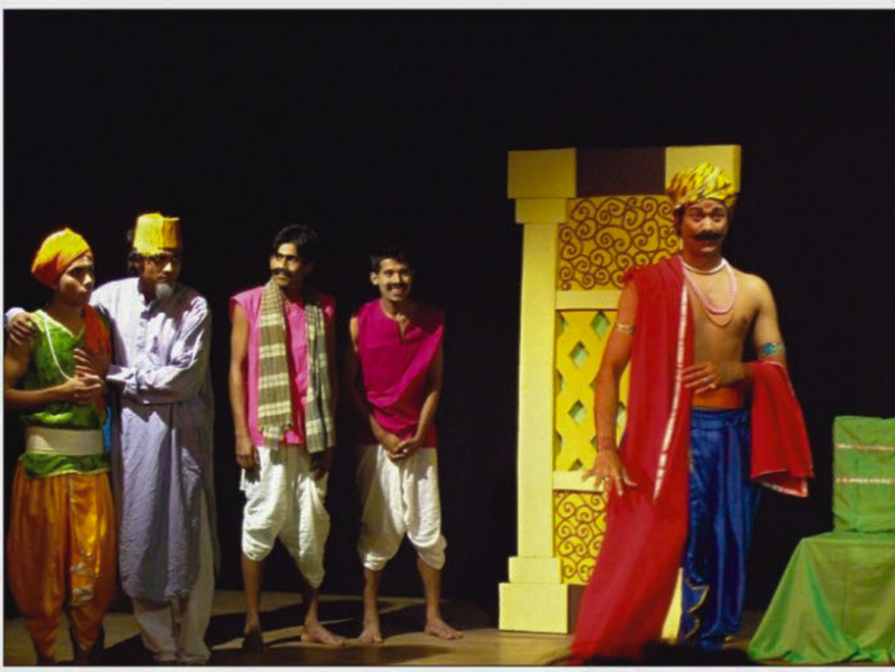
Actors perform in "Mon Paboner Nao".

"Mon Paboner Nao" narrates the tale of a prince named Madhob. He is the youngest of five siblings. After their father's demise, the elder brothers hatch a con-