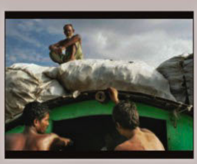
Photo Exhibition Photographer: Norbert Enker Title: Recycled Venue: Goethe-Institut Bangladesh, H-10, R-9, Dhanmondi Date: June 2-23 Time: 10am 8pm

Photography and Installation Show Photographer: Zaid Islam Title: Used Reused Venue: Dhaka Art Centre, R-7 A, H-60, Dhanmondi Date: June 5-16 Time: 3pm-8pm