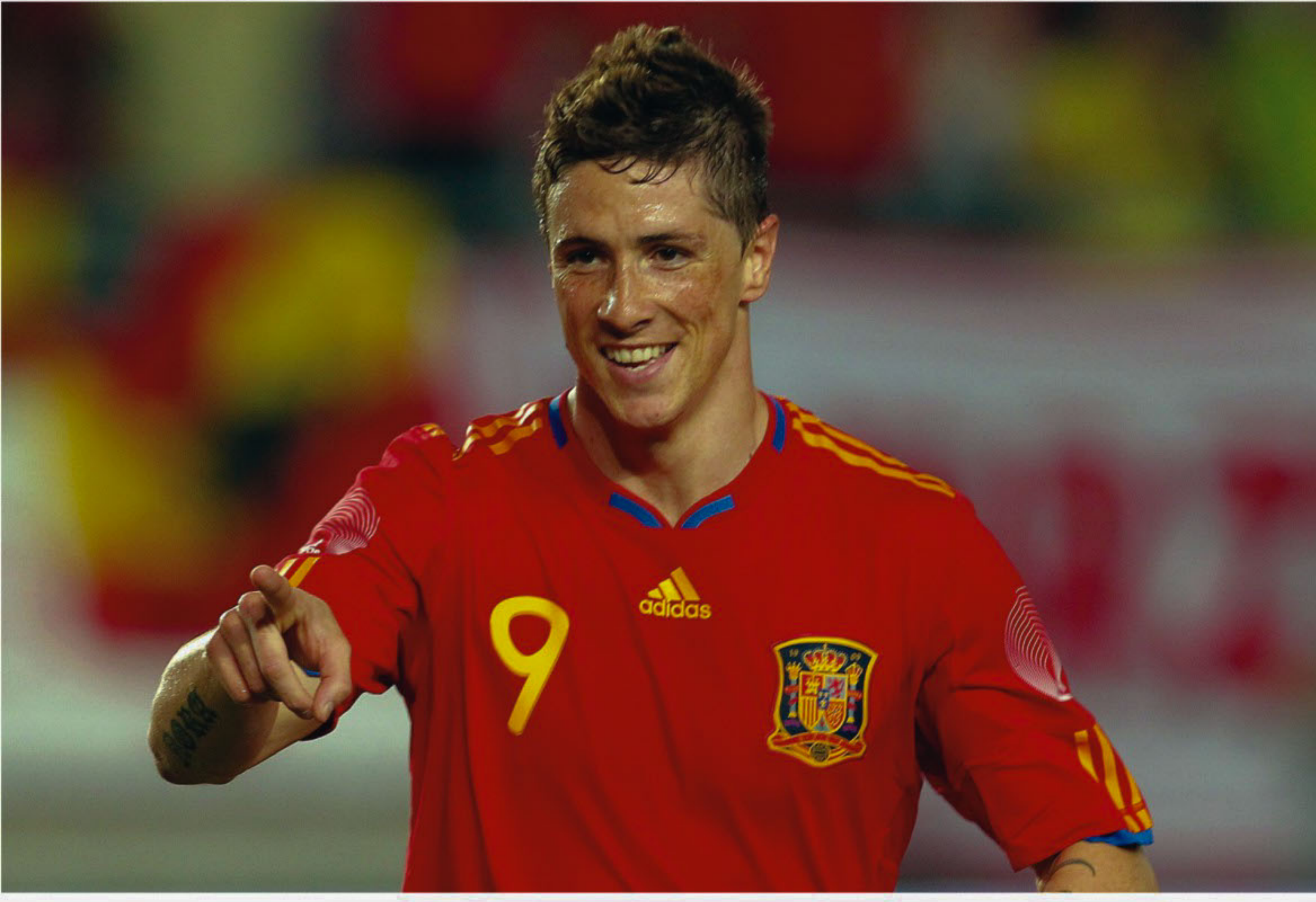
HE'S BACK: Striker Fernando Torres points in delight at teammate Pedro (not in picture) after coolly scoring Spain's fifth goal in a 6-0 rout of Poland at the Nueva Condomina Stadium in Murcia on Tuesday. The Liverpool hero, who underwent knee surgery in April, came on as a second-half substitute and fired home from a Pedro cross.