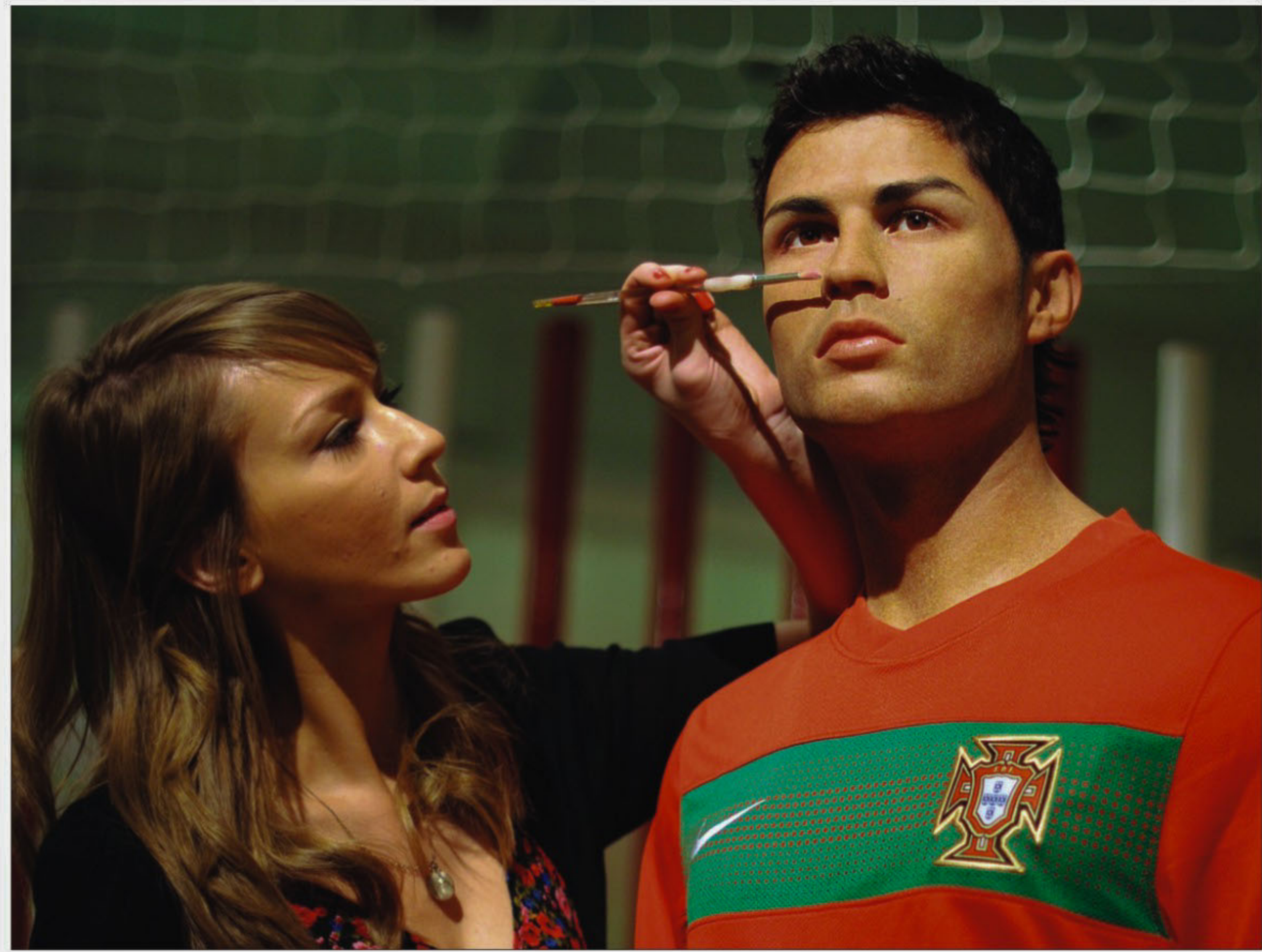
An artist puts finishing touches on a wax model of Portuguese superstar Cristiano Ronaldo after it was unveiled during a photocall at Madame Tussauds museum in London on Wednesday.

Huh will come up against Maradona for the first time since they met on the field in the 1986 finals, when the Korean's tough man-marking led the Argentine to recently talk of his opponents playing "taekwondo not football."