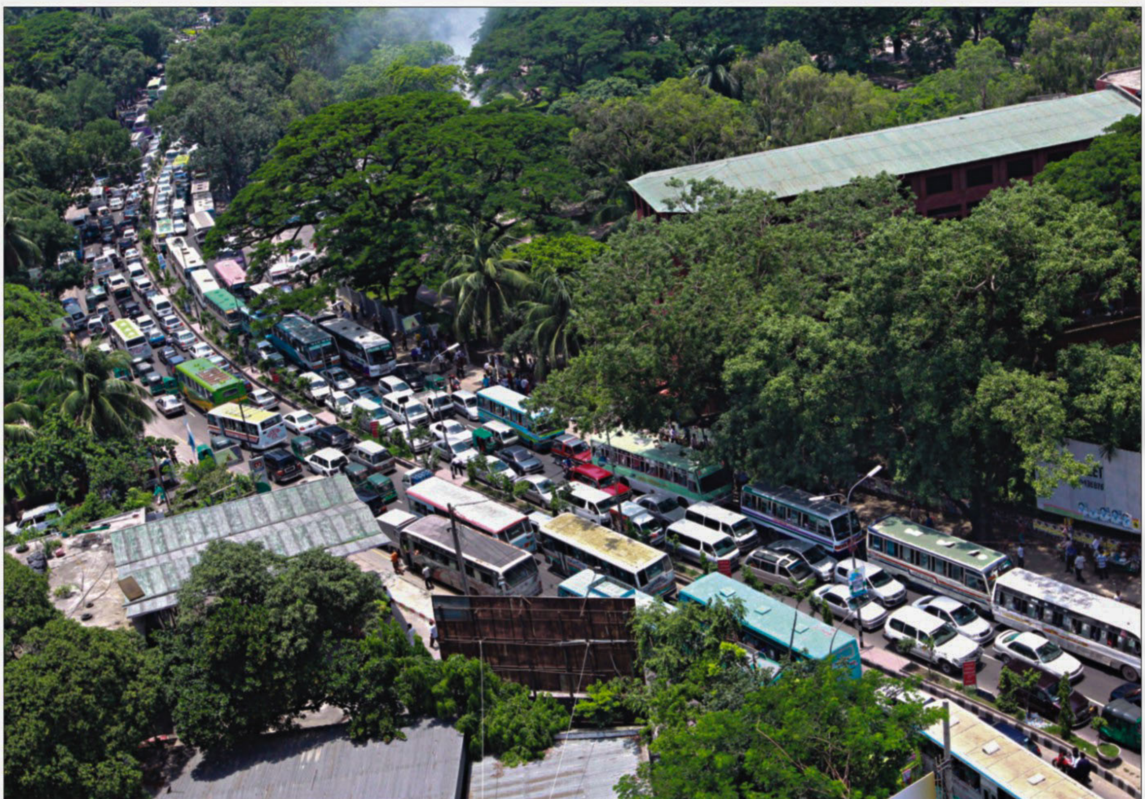
A huge tailback forms on the road in the High Court area yesterday, as the BNP stages a sit-in on the premises of Engineers Institution, Bangladesh nearby to protest the 'government interference in the judiciary'. (Story on Page-1)

The injured were admitted to Dhaka Medical College and Hospital.