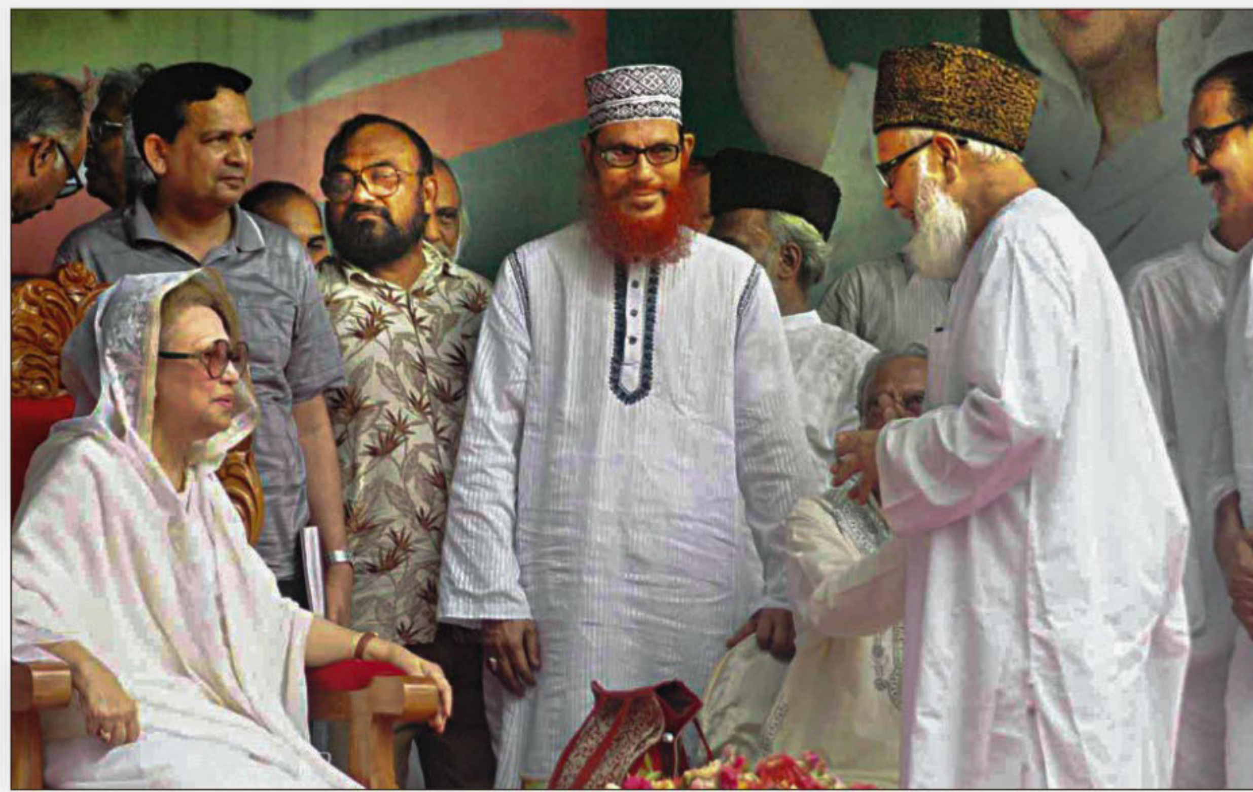
Leaders of Bangladesh Jamaat-e-Islami exchange views with BNP Chairperson Khaleda Zia yesterday during a sit-in programme in front of Institution of Engineers, Bangladesh.