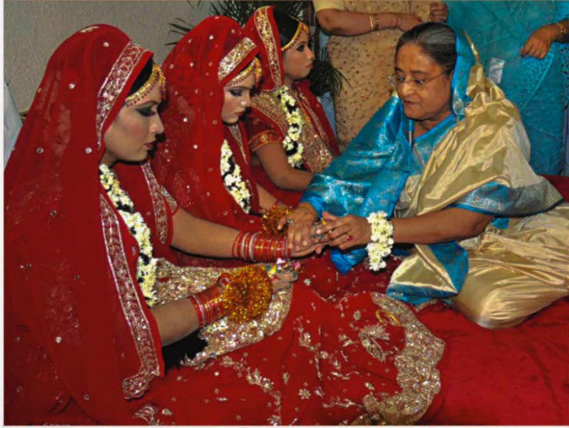
Prime Minister Sheikh Hasina helps the brides wear ornaments as their mother at Gano Bhaban yesterday.