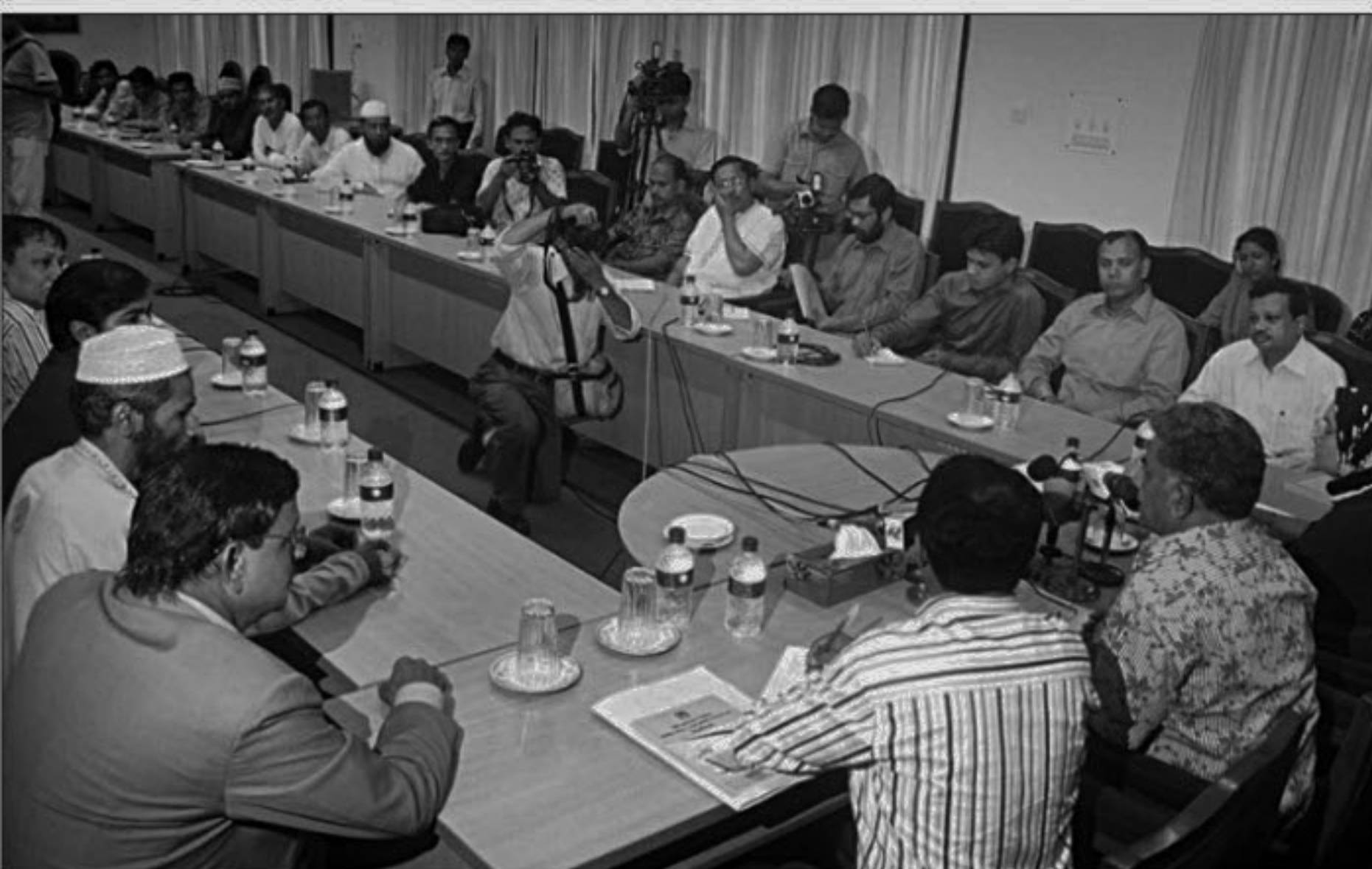
Election Commissioner Brig Gen Md Sakhawat Hossain addresses a view exchange meeting with local elites and journalists at Chittagong Circuit House, Nagarik Committee backed candidate in Chittagong city mayoral election ABM Mohiuddin Chowdhury conducts mass contact in CRB area in the city, and Chattagram Unnayan Andolon supported candidate M Manjur Alam does the same at Agrabad yesterday.