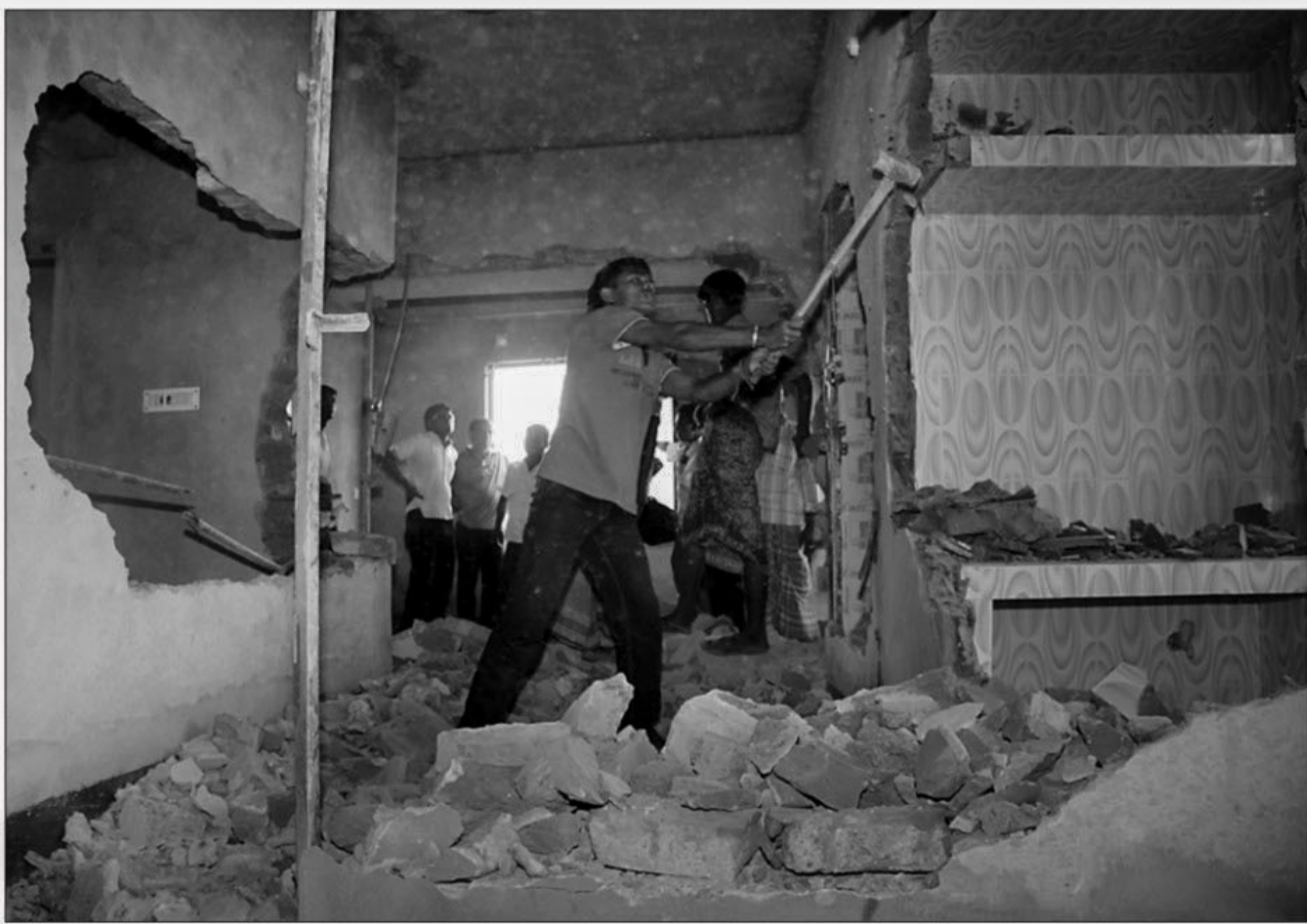
Rajdhani Unnayan Kartripakkha (Rajuk) starts knocking down a seven-storey illegal building in the city's east Begunbari yesterday. (Story on Page 1)