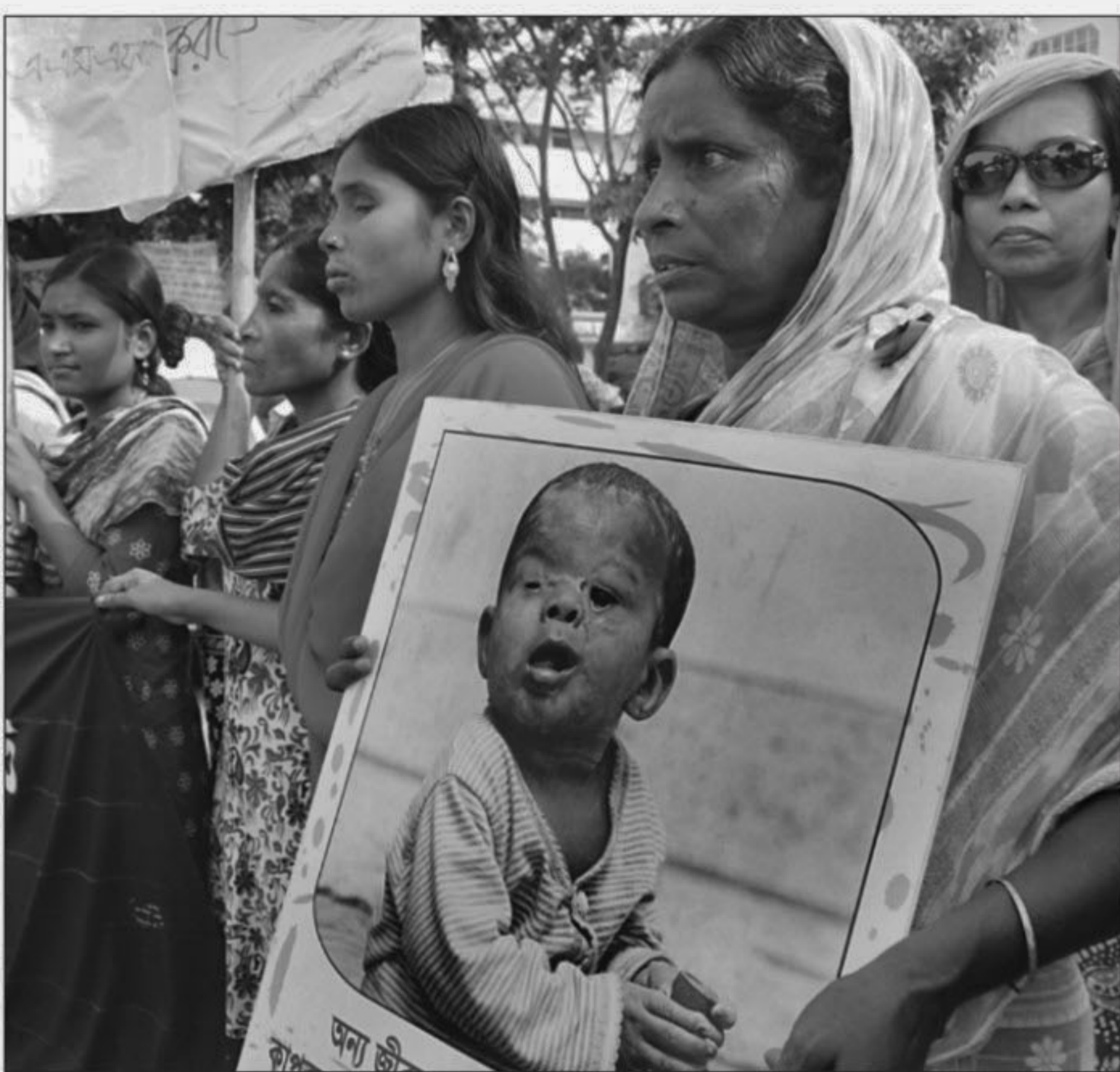
Acid Survivors Foundation forms a human chain in front of Dhaka Medical College Hospital in the city yesterday demanding fair investigation into the Nimtole fire incident. (Story on Page 5)