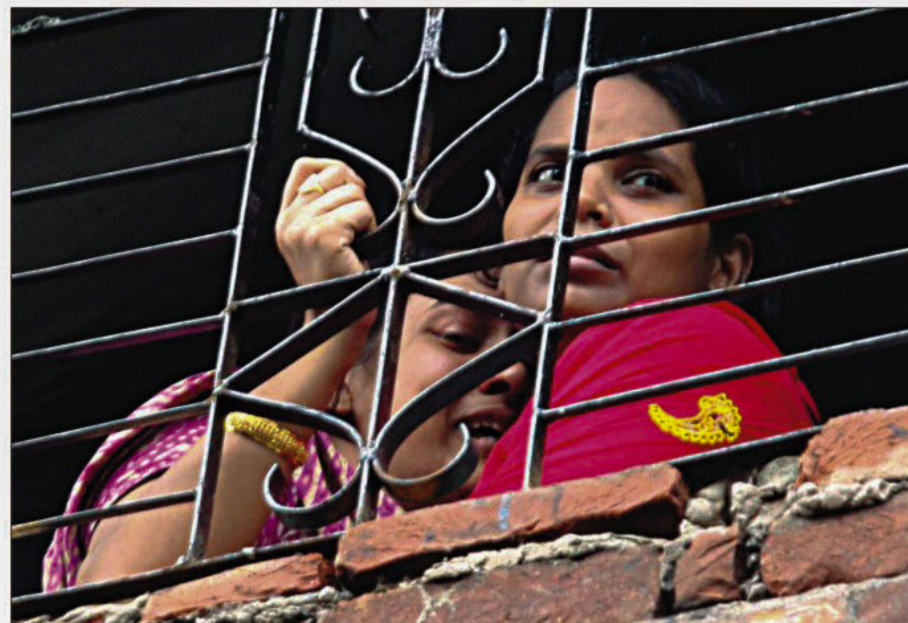
A girl in flood of tears embracing a relative in Nimtoli yesterday. Thursday night's blaze claimed her brother's life and burnt her sister, who is now struggling for life at a hospital.