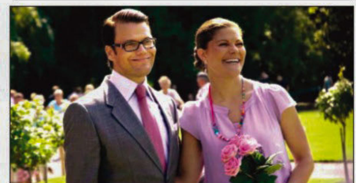
Crown Princess Victoria and Daniel Westling

The Swedish monarchy, regarded as the world's most modern, has become increasingly popular in recent years. One of the reasons for this may be that Crown Princess Victoria, who has become one of her country's most important ambassadors, will be getting married on June 19.