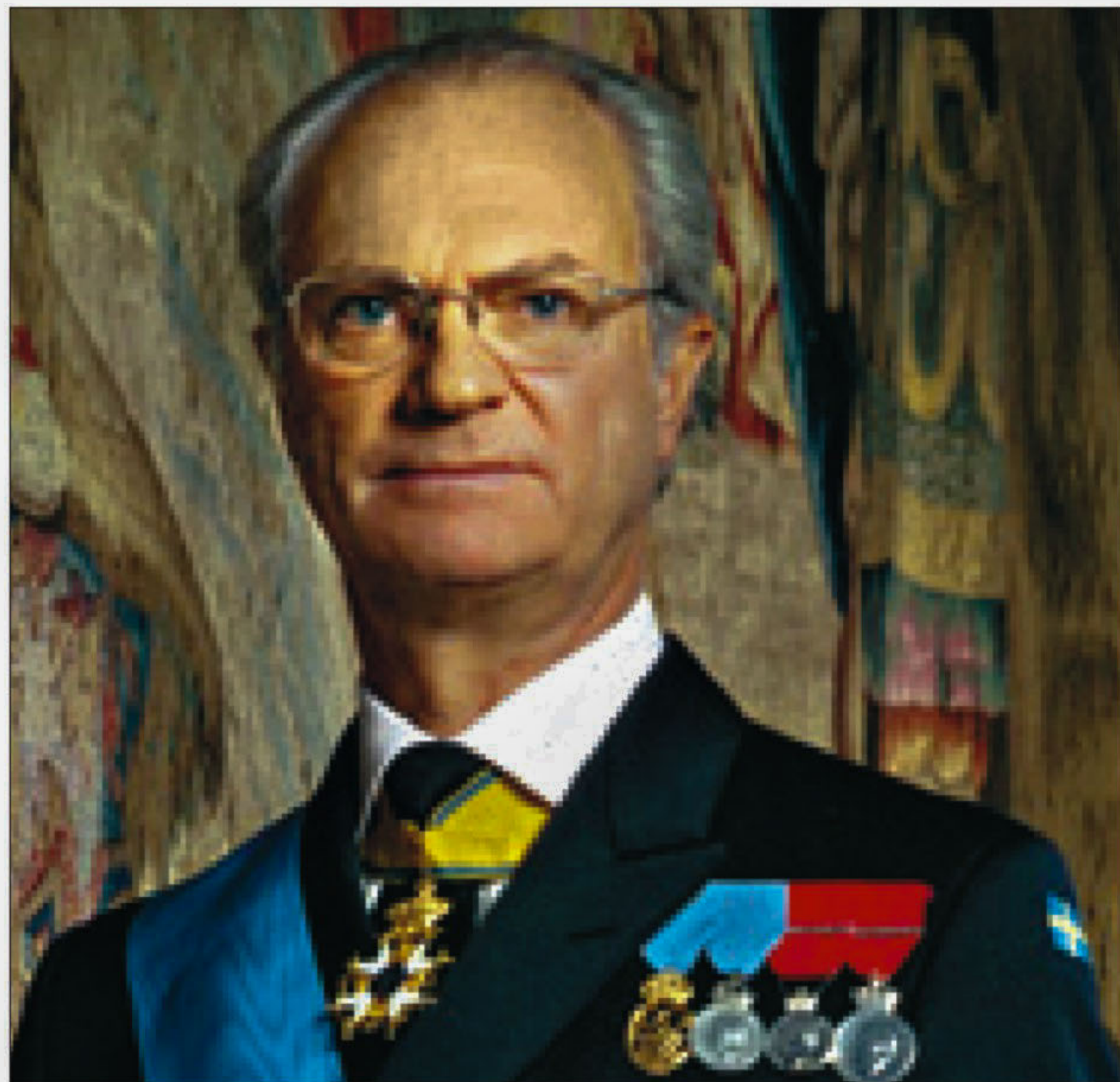
His Majesty King Carl XVI Gustaf