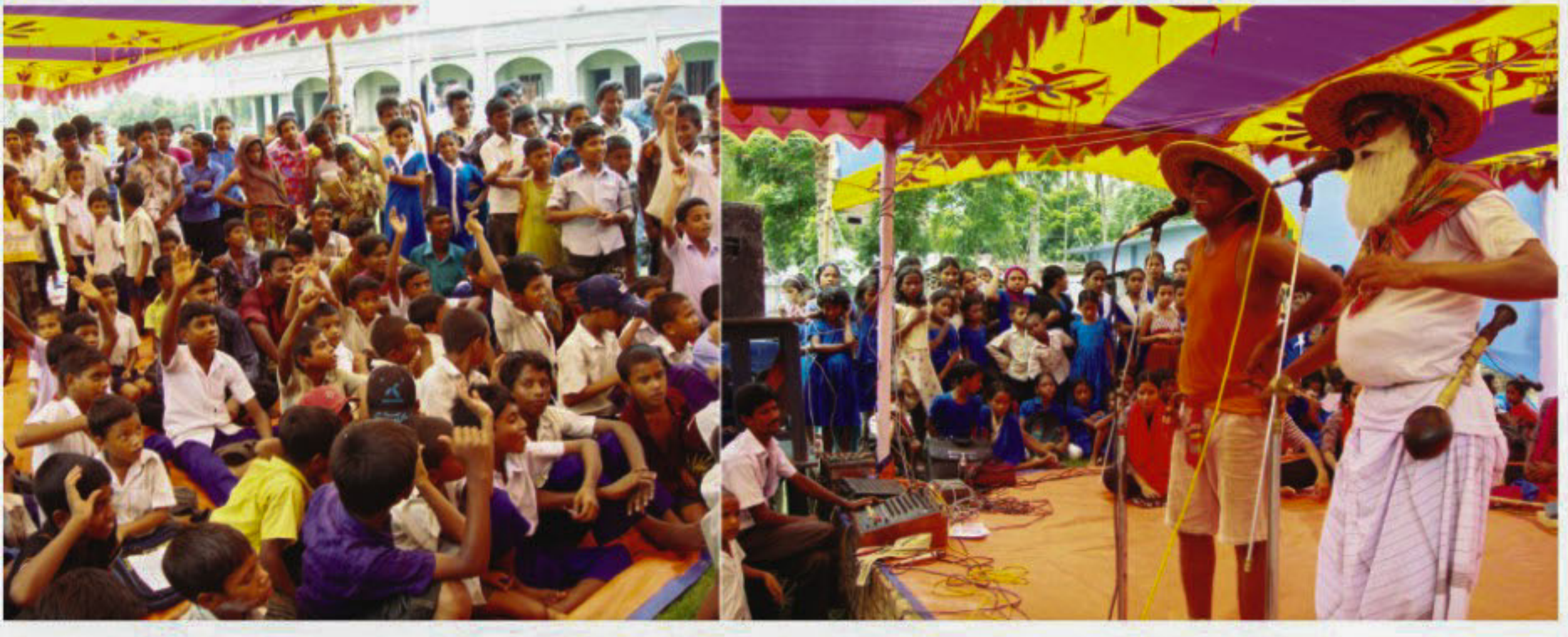
Traditional Nana-Nati duo (right); with audience.