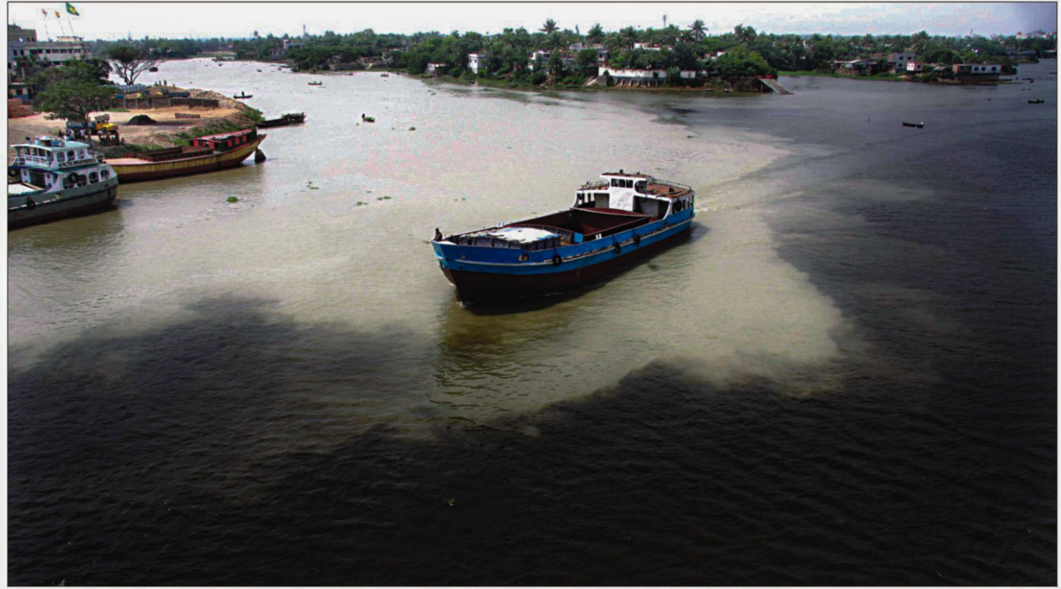
Fresh water coming in from the Bangshi, left, shows how murky the water of the Turag has become. The photo was taken from the Amin Bazar bridge near Gabtali in the capital.