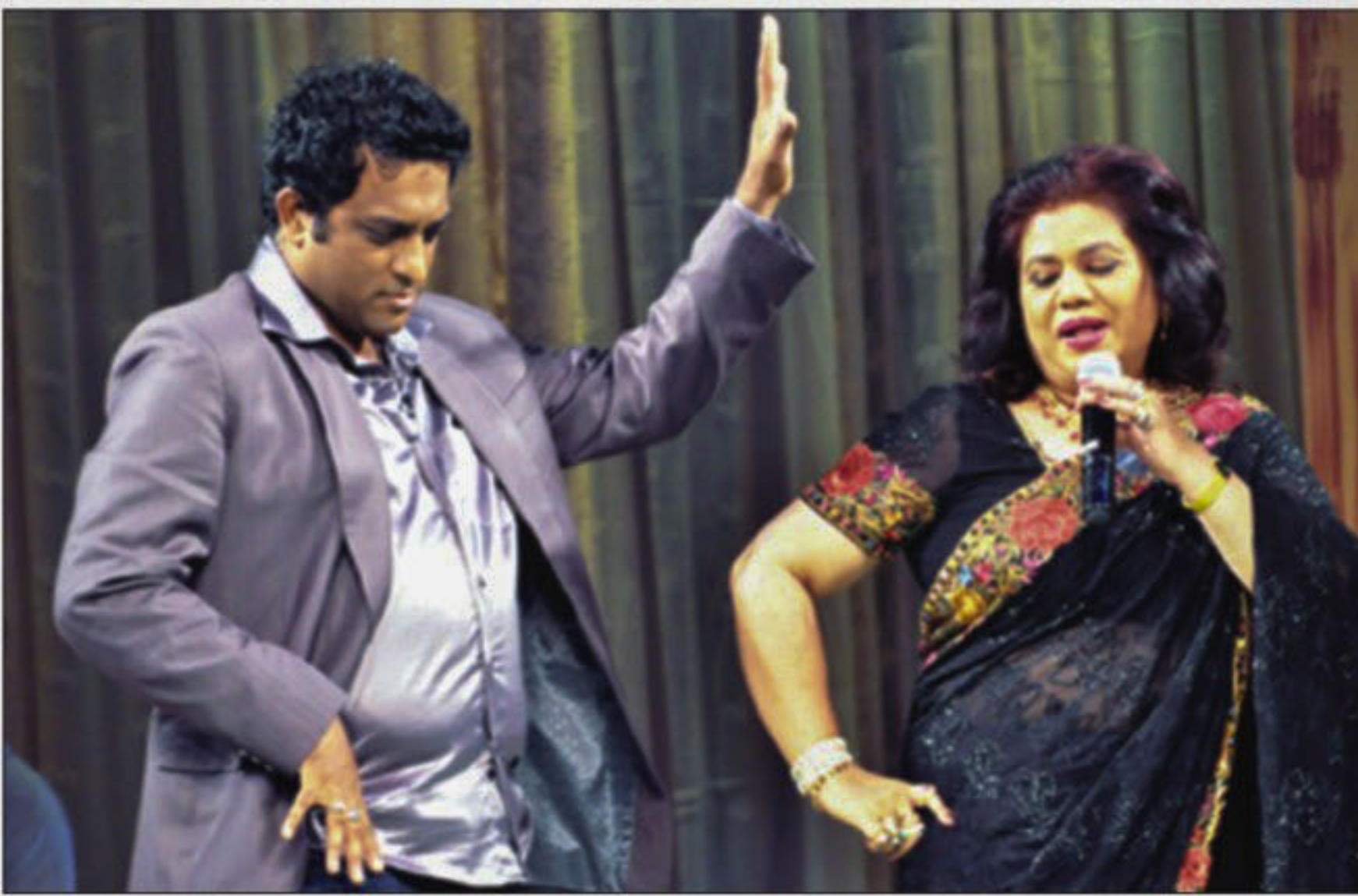
Anuraag Basu and Runa Laila on the show.

A CORRESPONDENT Internationally renowned Bangladeshi singer Runa Laila is the featured celebrity on tonight's "Ke Hobey Biggest Fan" (Who will be the biggest fan) on Zee Bangla at 10 pm. The show is hosted by Bollywood director Anuraag Basu. "Ke Hobey Biggest Fan" highlights the life and journey of a celebrity. In each episode, a celebrity's personal life, first love, hobbies, aspirations and more are revealed.