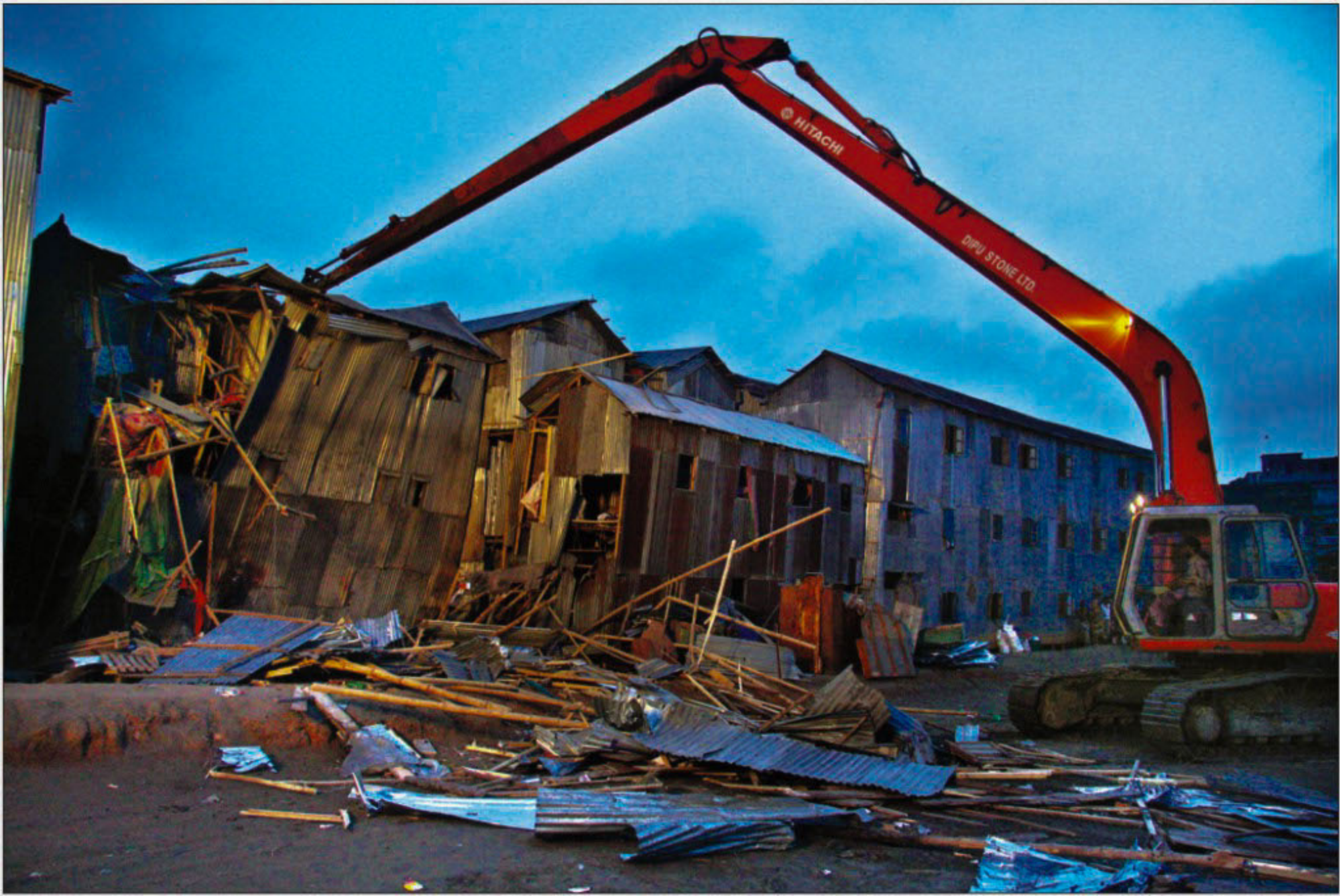
An excavator is making way for heavy construction equipment to join the rescue operation at the Begunbari building collapse site in the capital yesterday. Right, another unauthorised five-storey building in the locality posing similar threat.