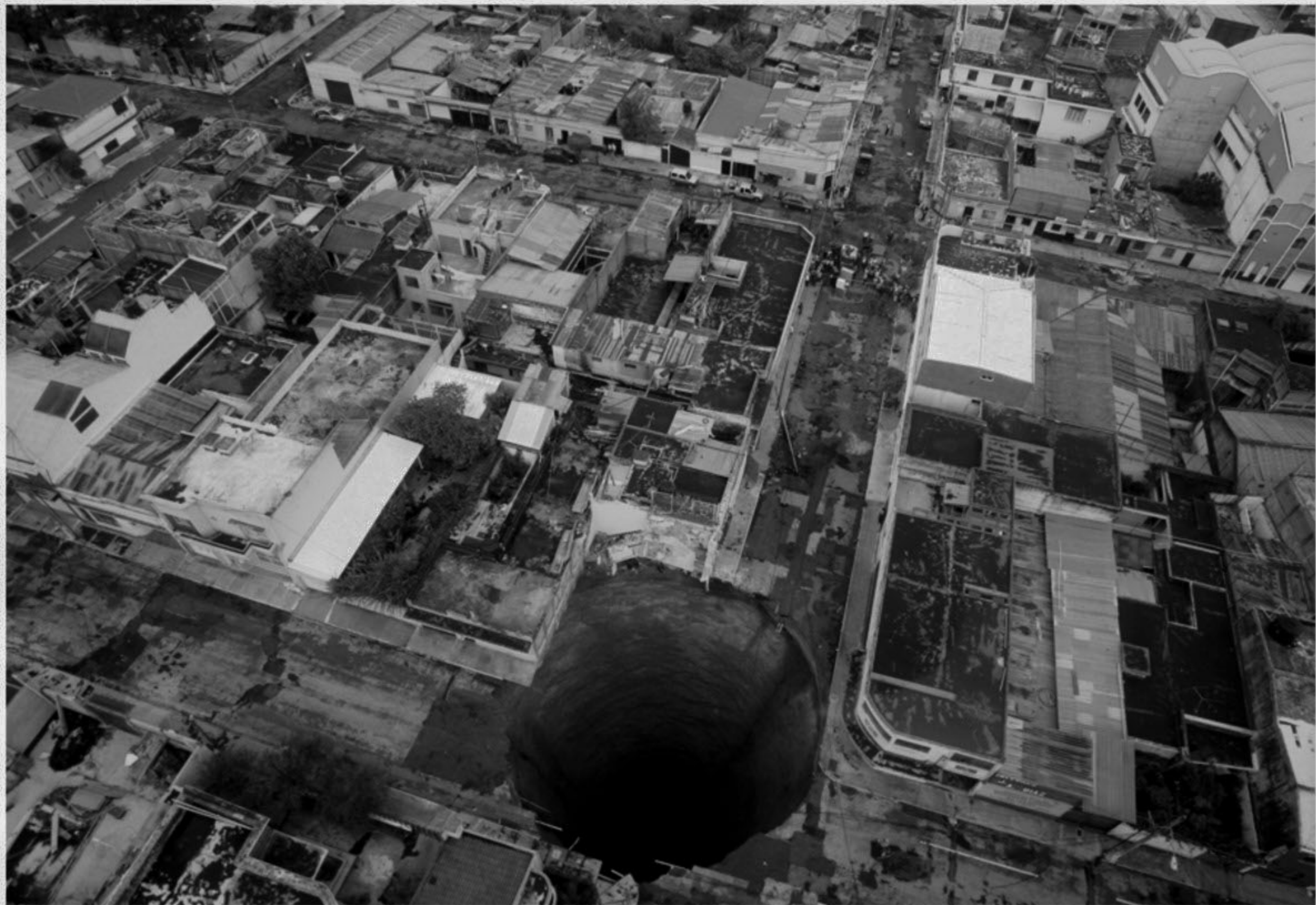
A giant sinkhole caused by the rains of Tropical Storm Agatha is seen in Guatemala City yesterday. More than 94,000 people have been evacuated as the storm buried homes under mud, swept away a highway bridge near Guatemala City and opened up sinkholes in the capital.