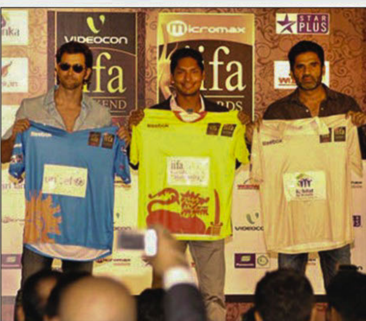
Hrithik Roshan, Kumar Sangakkara and Sunil Shetty

Artistes of Amra Ka'jon Shilpo Goshthi dance on the last day (May 30) of the two-day theatre festival organised by the group. The event was held at Tito Auditorium in Bogra.