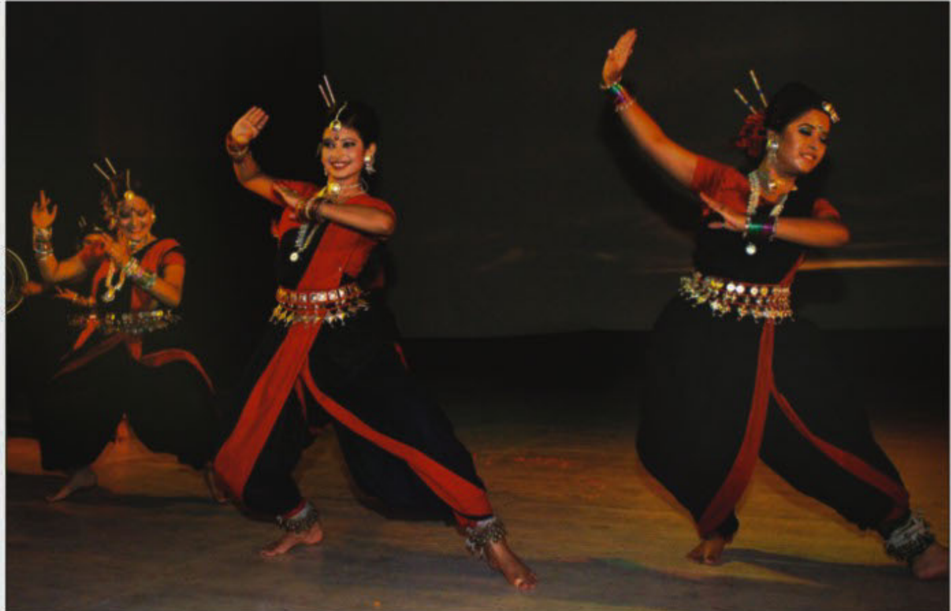
PHOTO: STAR Artistes of Amra Ka'jon Shilpo Goshthi dance on the last day (May 30) of the two-day theatre festival organised by the group. The event was held at Tito Auditorium in Bogra.