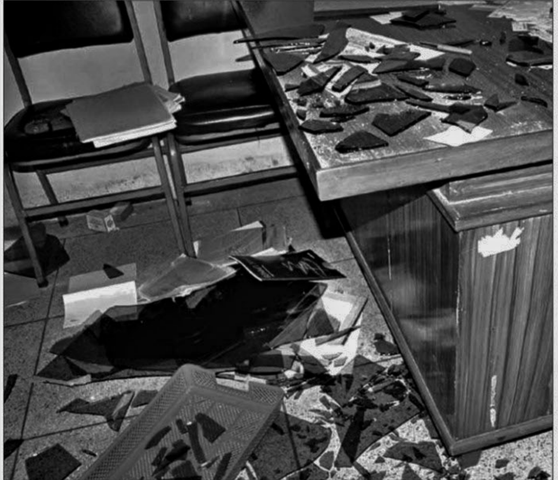
A group of aggrieved doctors who did not qualify in the adhoc basis recruitment examination vandalise rooms of pro-Awami League doctors at Bangabandhu Sheikh Mujib Medical University yesterday.