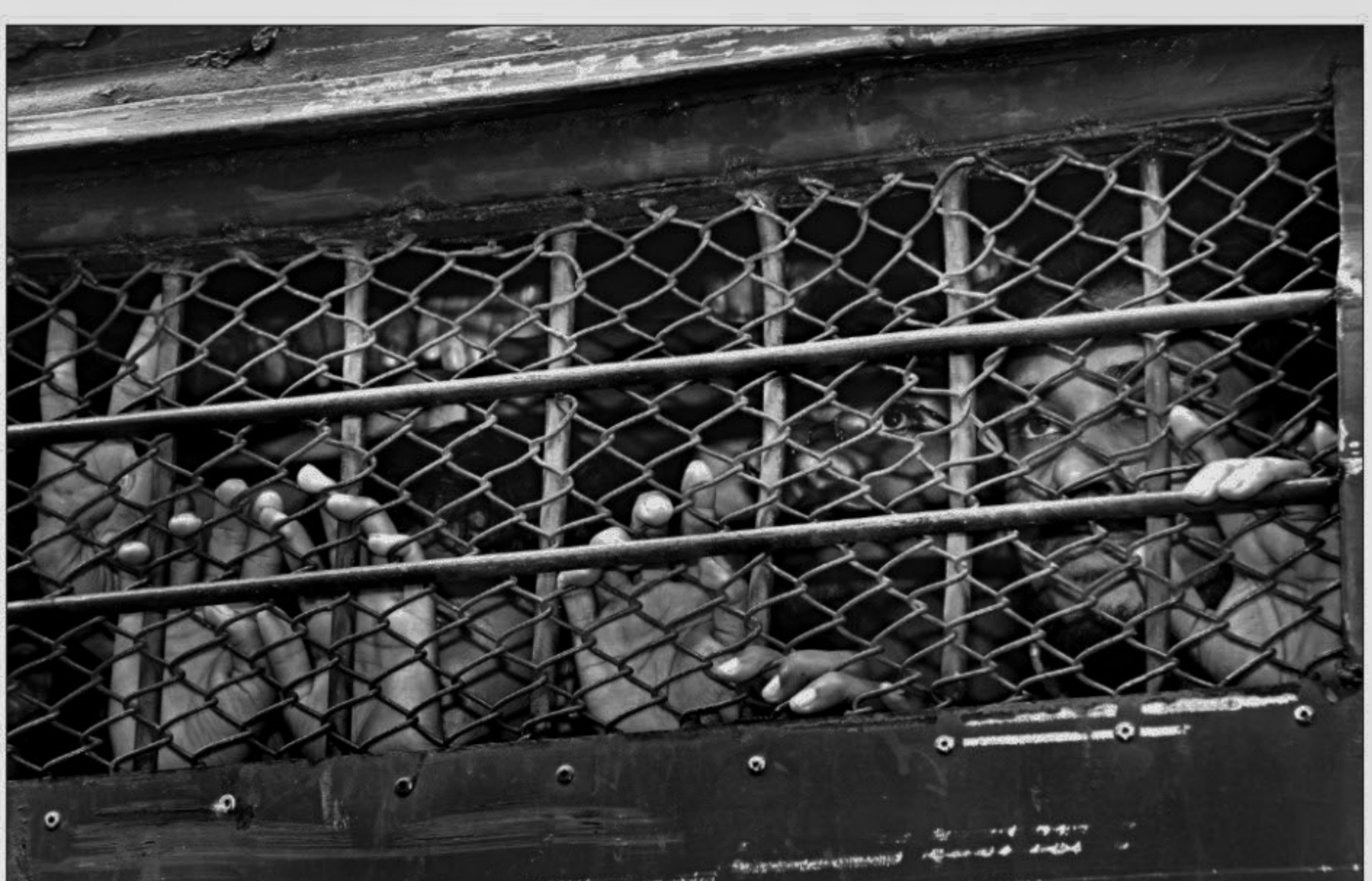
Jamaat and Shibir leaders and activists who were arrested near Baitul Mukarram National Mosque and Paltan Maidan were brought to Paltan police station by a prison van yesterday. (Story on Page 1)