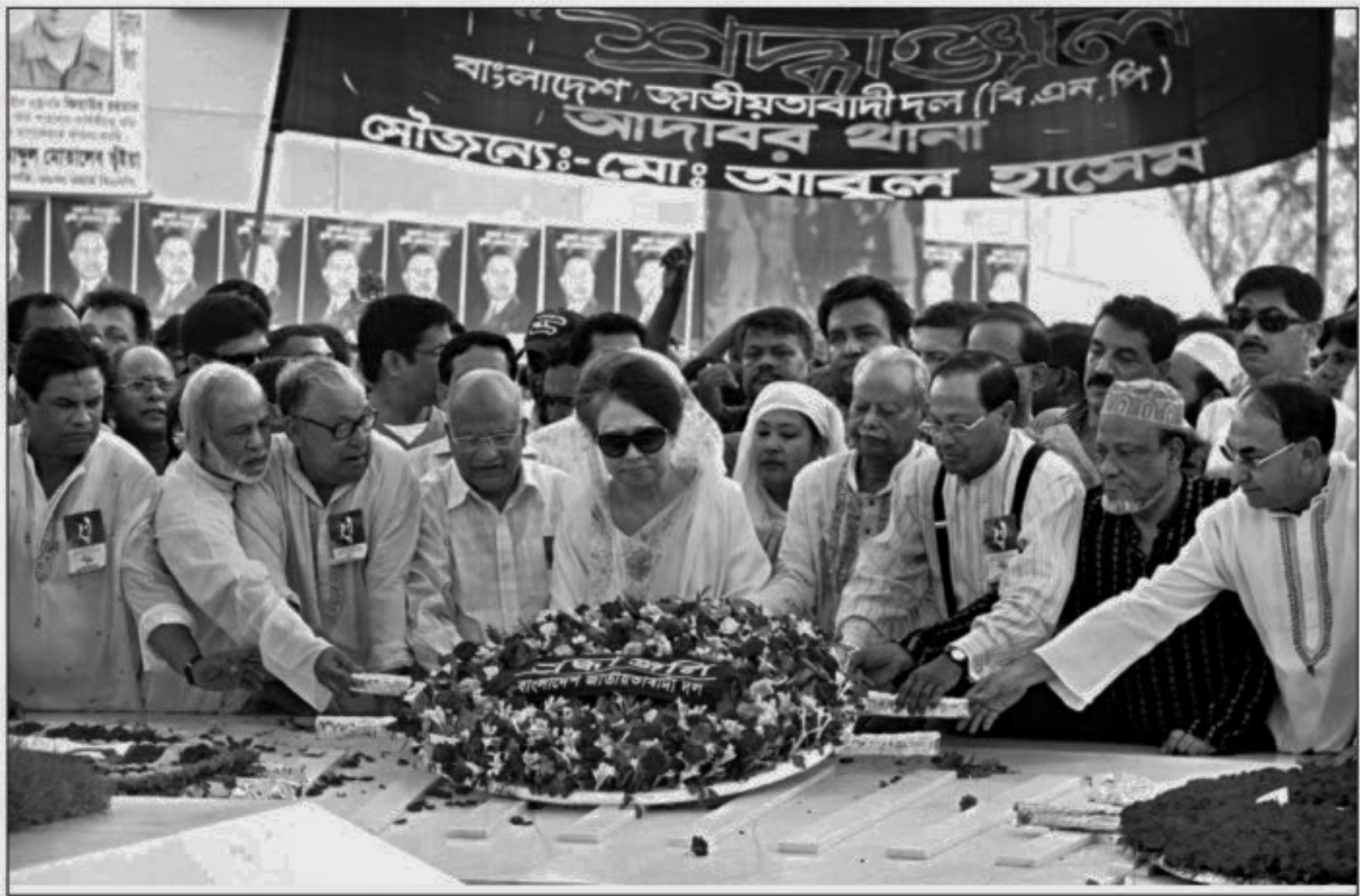
BNP Chairperson Khaleda Zia along with her party leaders places wreaths at the grave of late president Ziaur Rahman at Sher-e-Bangla Nagar in the city yesterday.