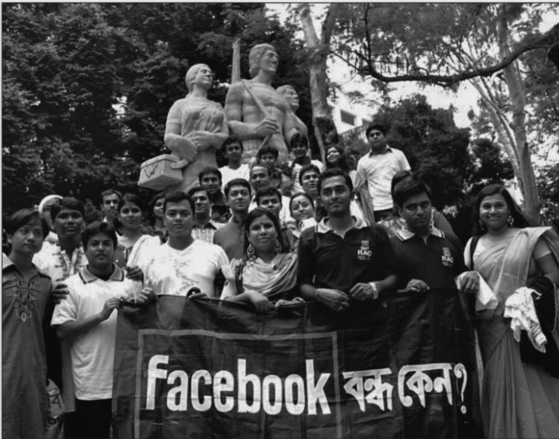
A group of Dhaka University (DU) students form a human chain on the campus yesterday to protest the government decision to block the Facebook.

In a separate press release, Bangladesh Chhatra Moitree also expressed grave concern and demanded immediate withdrawal of the ban.