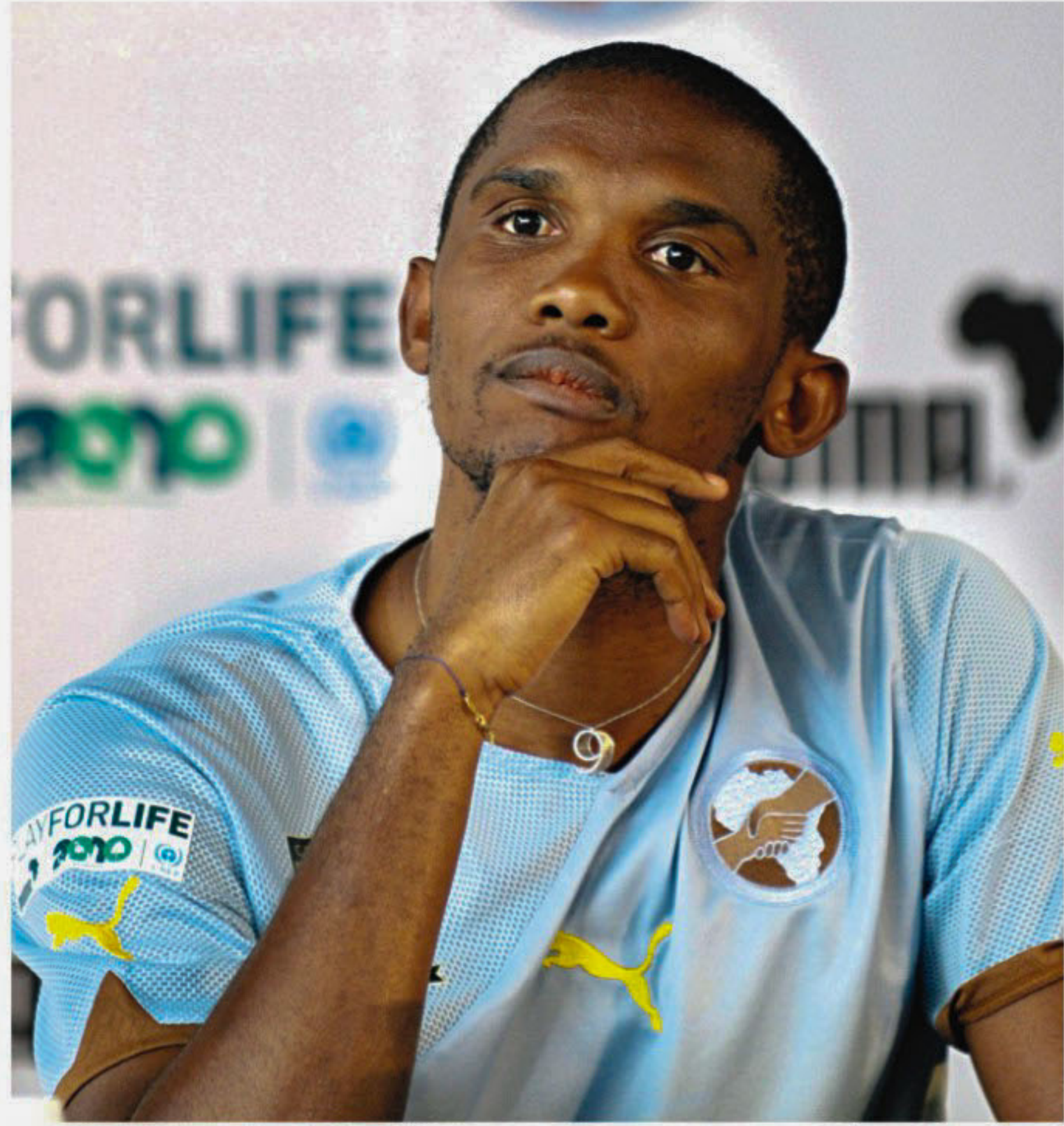
Cameroon captain Samuel Eto'o addresses a press conference at the Michel Hidalgo Stadium in Saint-Gratien near Paris on Friday.

But five games, four goals, and several samba shuffles later and the veteran striker had catapulted himself into the World Cup's hall of fame as perhaps the most famous African footballer ever.