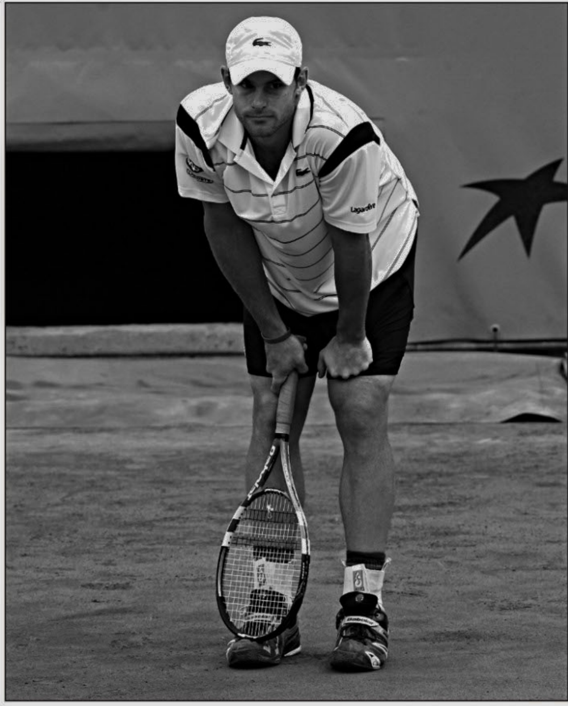
Andy Roddick vents his frustration during his match against Russia's Teimuraz Gabashvili in the French Open at Roland Garros yesterday. Roddick lost the match 4-6, 4-6, 2-6.

FROM PAGE 17 Petrova had already squandered three match points, but in a final set that contained 11 service breaks, the two-time semifinalist held her nerve and will tackle second seed Venus Williams for a place in the quarterfinals.