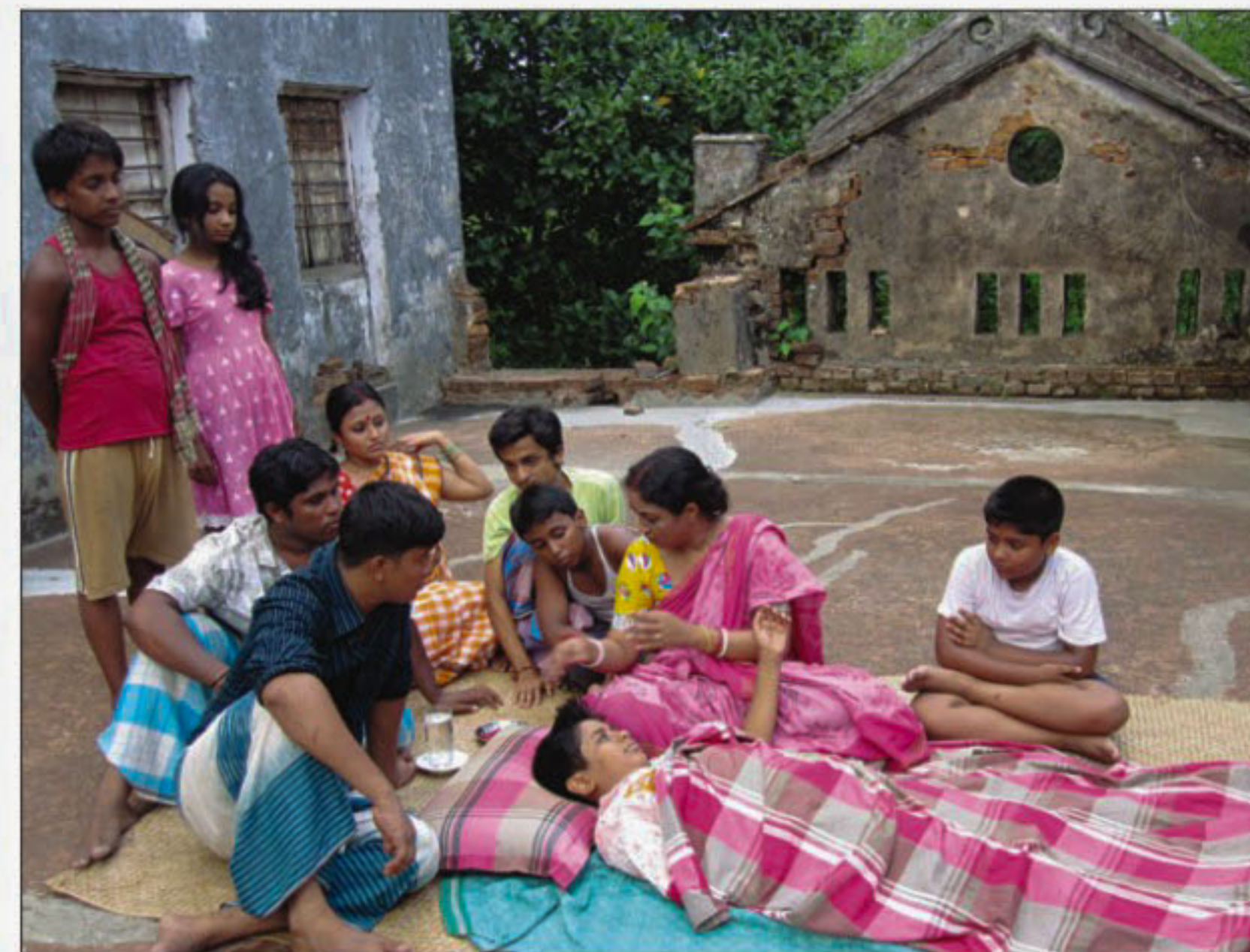
A scene from the film.

The young artistes of Faridpur Chander Haat and BTV enacted the various characters in the film.