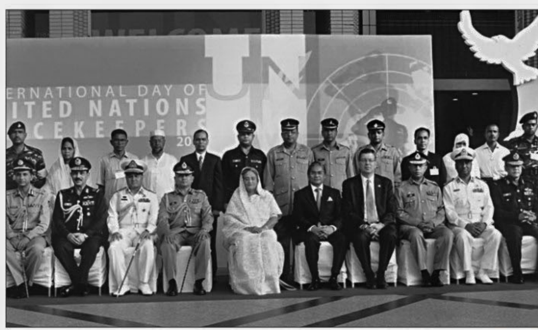
Family members of the dead or injured peacekeepers pose for photograph with Prime Minister Sheikh Hasina at a function at Bangabandhu International Conference Centre in the city yesterday.

Personnel Carriers for Bangladeshi peacekeepers so that the armed forces and police personnel from the country could be included in the peacekeeping missions with increasing numbers.