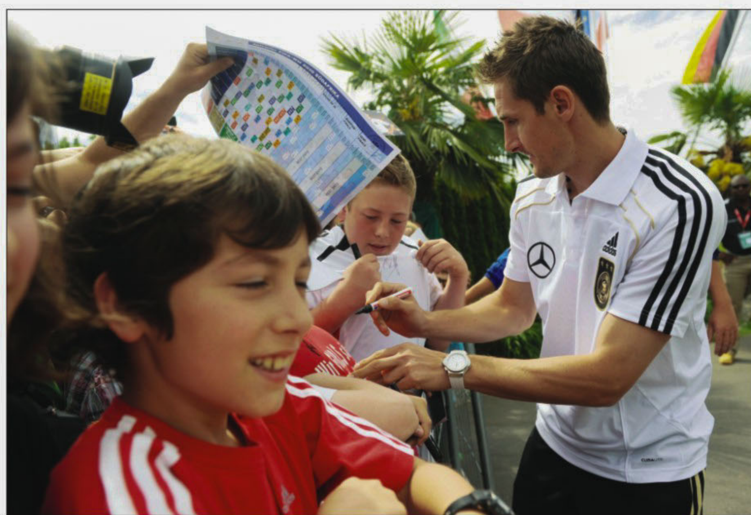
Germany striker Miroslav Klose (R) signs autographs at the team's training camp in Appiano on Friday.

"Sometimes things in South Africa are ready in the last minute. But we fully trust FIFA that we will move into our Velmore Grande base," said Bierhoff.