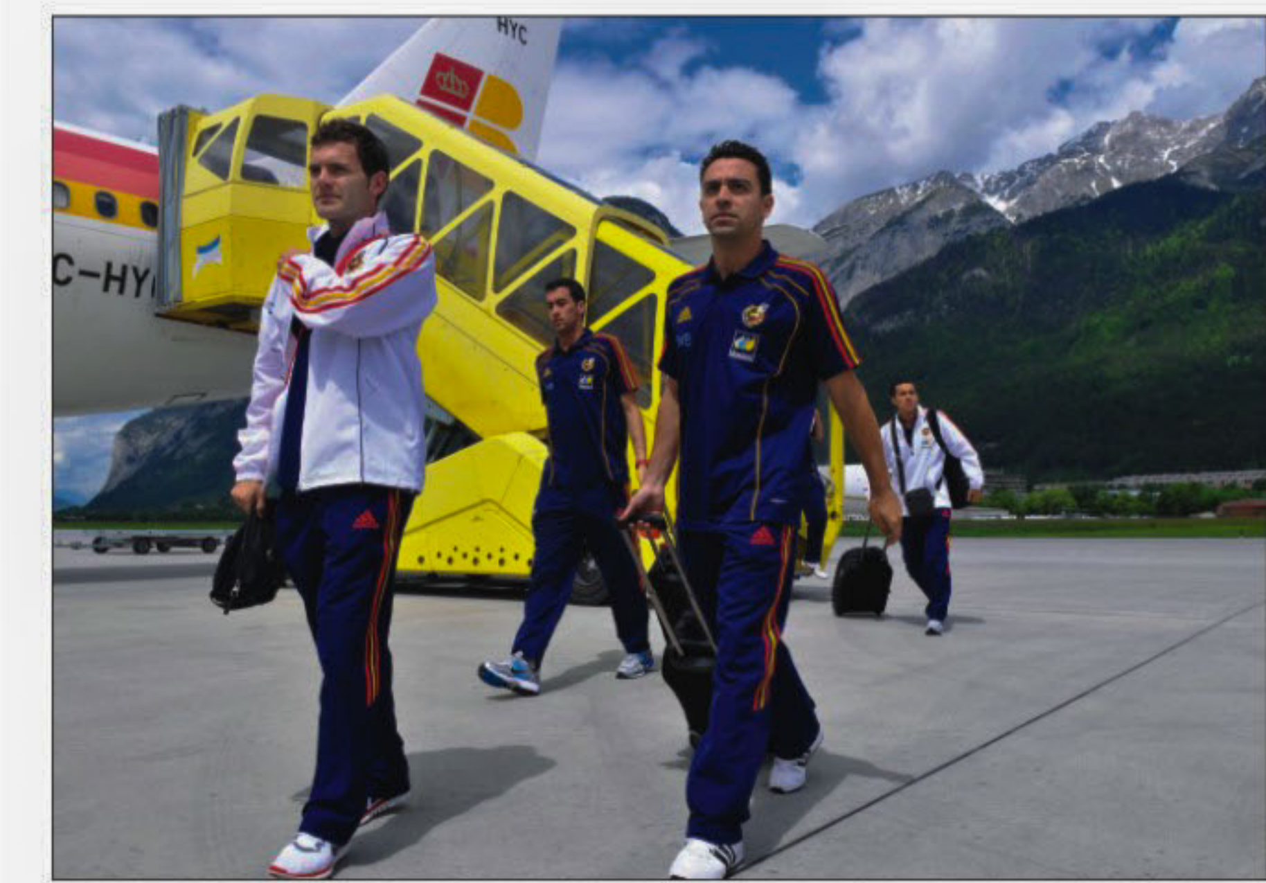
Spain players Juan Manuel Mata (L) and Xavi (R) arrive with teammates at Innsbruck Airport ahead of their training camp in Austria on Friday.