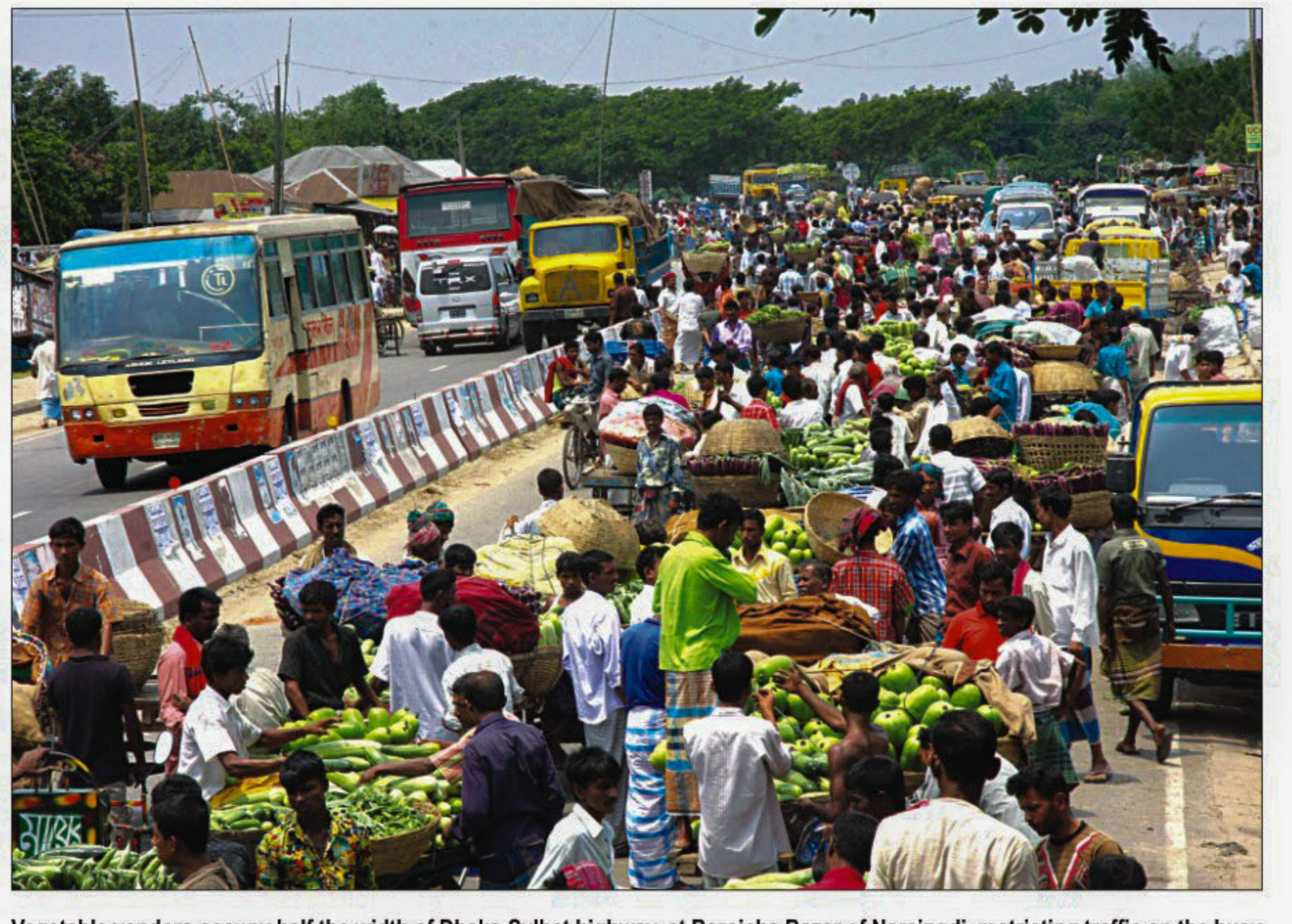
Vegetable vendors occupy half the width of Dhaka-Sylhet highway, at Baroicha Bazar of Narsingdi, restricting traffic on the busy road.

Says Syed Ashraf STAFF CORRESPONDENT The government would soon place a bill in parliament to restore the original constitution of 1972, said LGRD Minister Syed Ashraf Islam yesterday. "The constitution of 1972 can only be reinstated in the parliament, not through High Court or Supreme Court verdicts," he said while addressing an anti-militancy convention organised by Platform against Communalism and SEE PAGE 15 COL 8