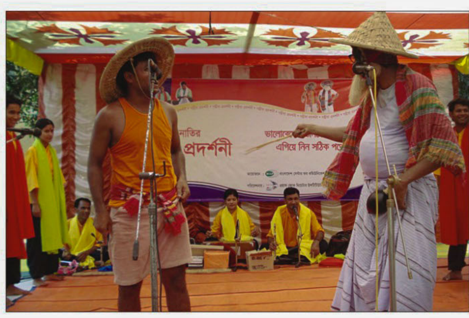
Performers during a Gambhira act.