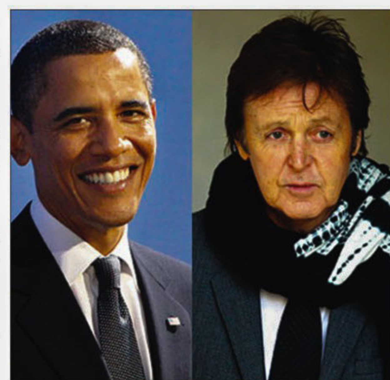
Barack Obama and Sir Paul McCartney

Ex-Beatle Sir Paul McCartney will receive the third Gershwin Prize for Popular Song from the Library of Congress from US President Barack Obama. The singer will perform at the White House as he will receive the honour. He will appear next week, with the show being broadcast in the US over the summer. The president and first lady are hosting the show in the East Room on June 2, reports The Telegraph. In 2009, the prize-awarded to musicians for a lifetime of song-writing-- went to Stevie Wonder.