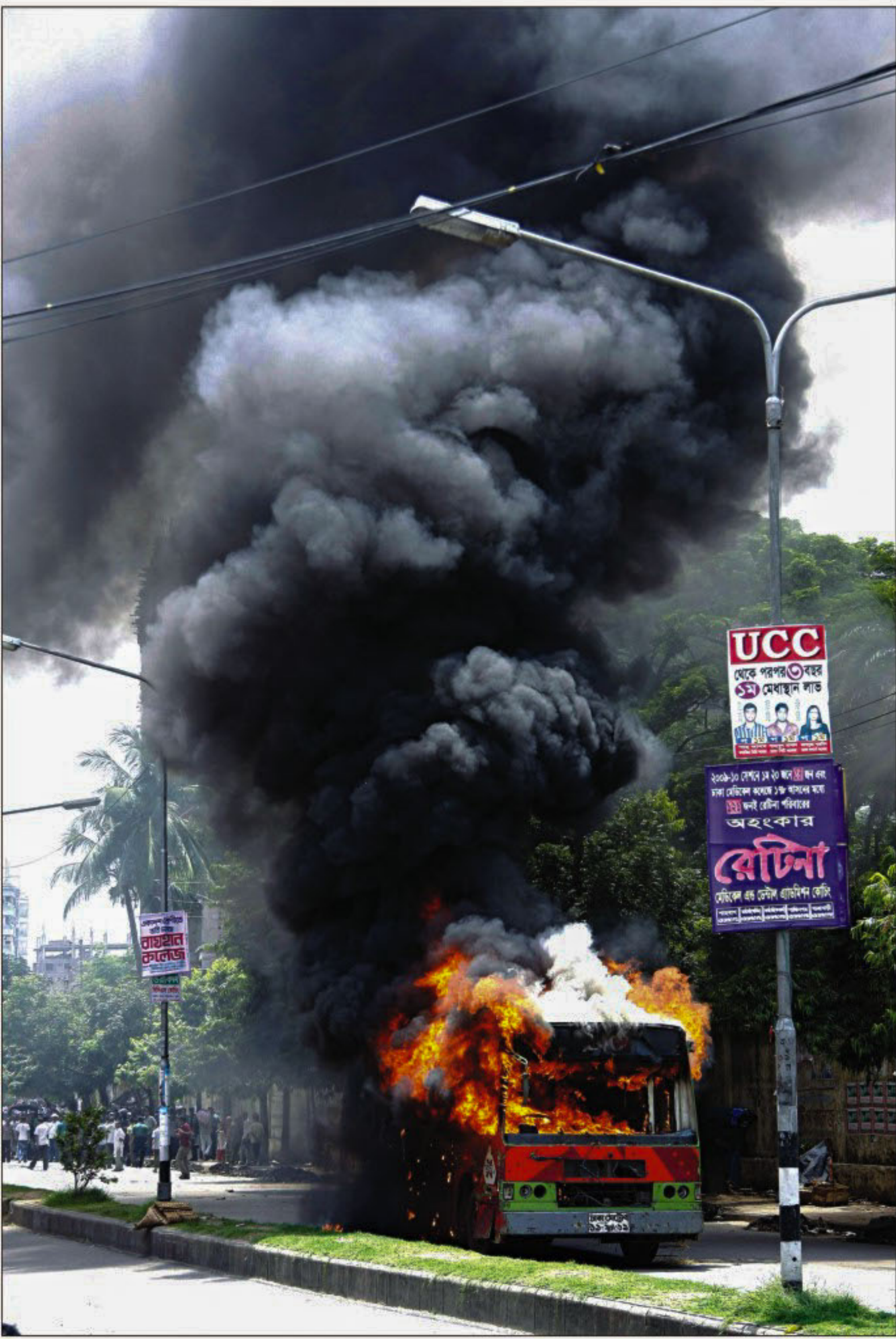
A bus set on fire in the capital's Palashi yesterday. Buet students rampaged through the area and torched vehicles after Khandaker Khanjahan Samrat, a level-one student, was crushed to death by a bus at Azimpur in the morning.