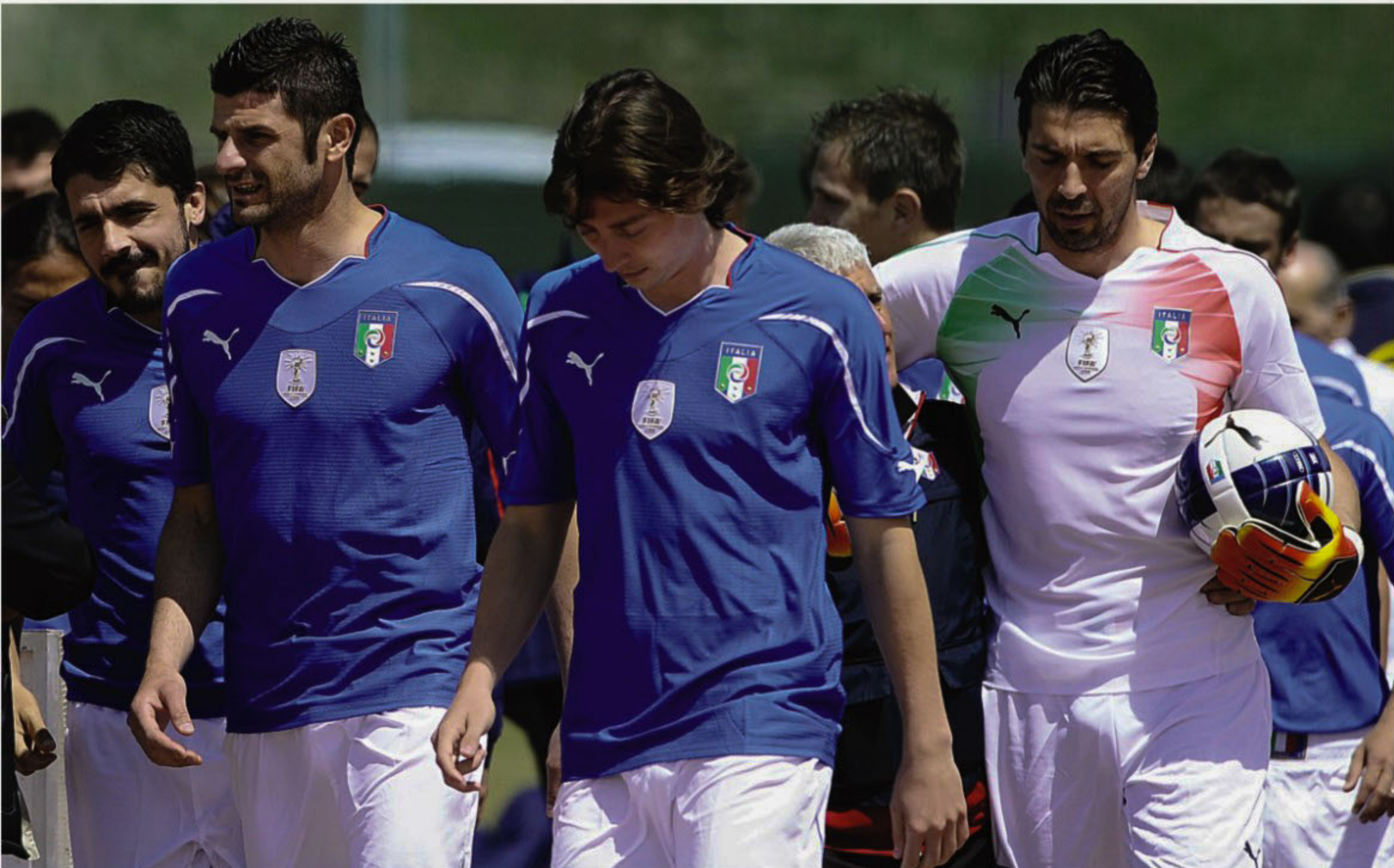
Italy players walk off the pitch after an official team picture session in Sestriere on Wednesday. The world champions are holding their training camp in the Italian Alps.