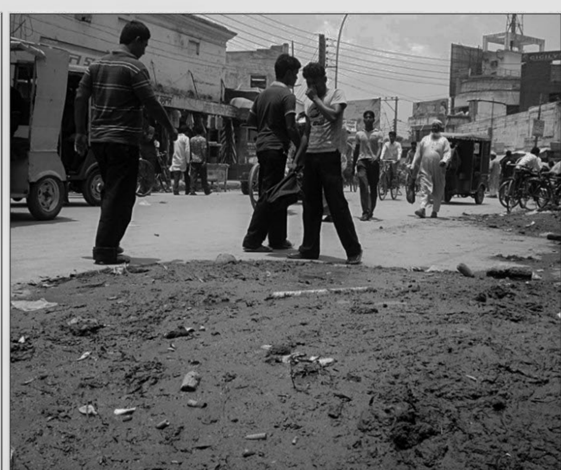
Waste materials from drains, left by municipality workers on a large portion of the main road of Rangpur town, remain a nuisance for town dwellers for days.