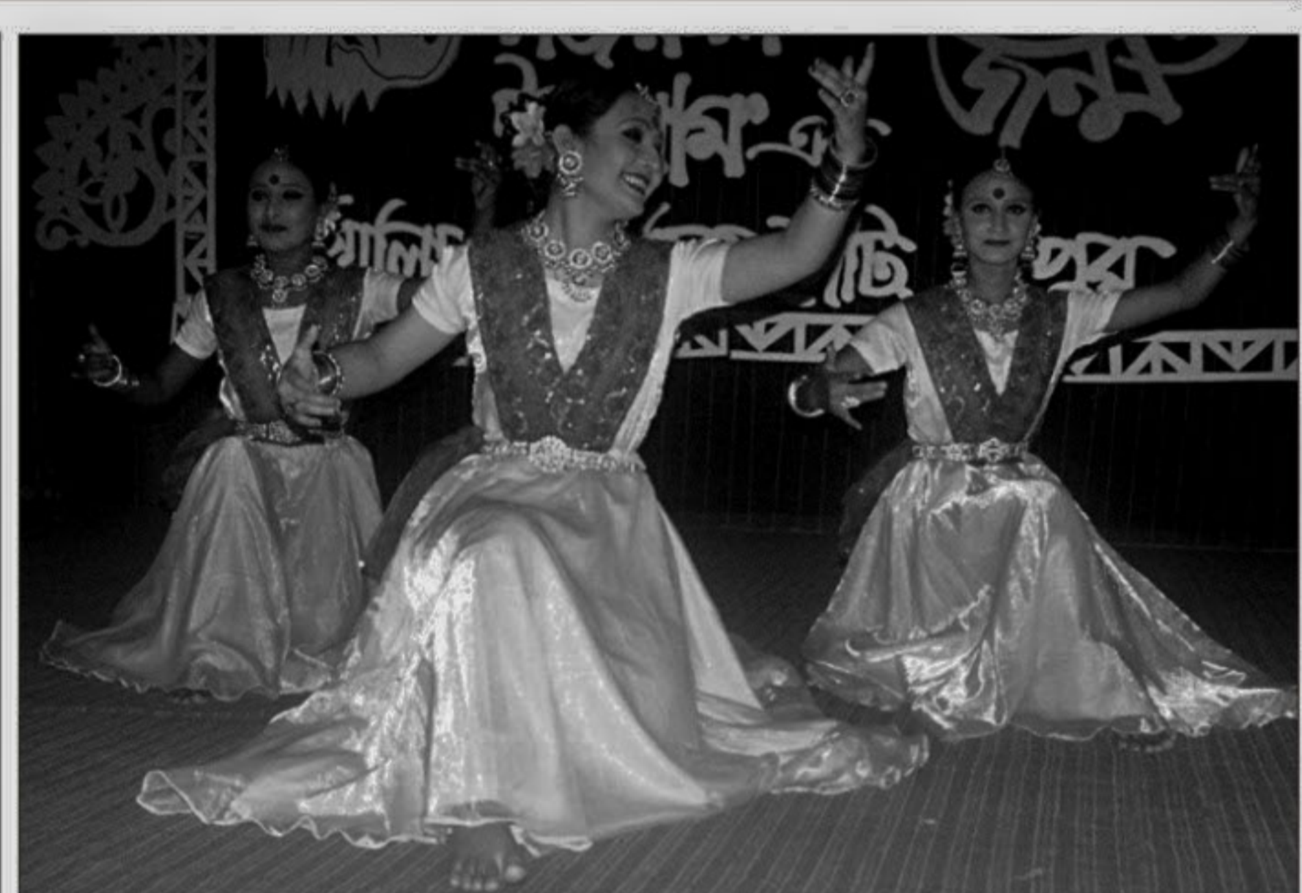
Artistes perform at the cultural function organised by Sammilito Sangskritik Jote at Rangpur Town Hall marking 111th anniversary of birth of national poet Kazi Nazrul Islam yesterday.